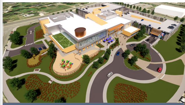
Kingstowne Regional Library- Collocated Facility