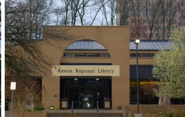
Reston Regional Library