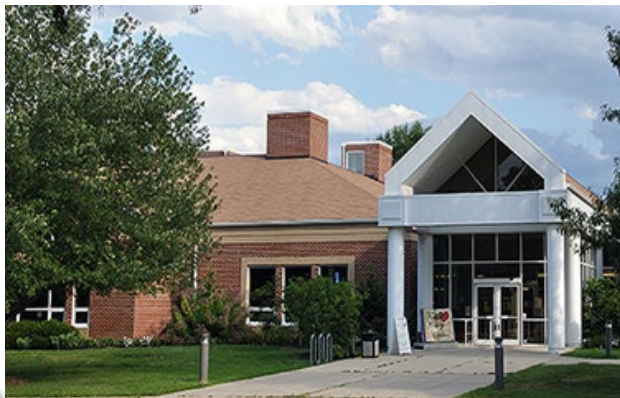
Sherwood Regional Library