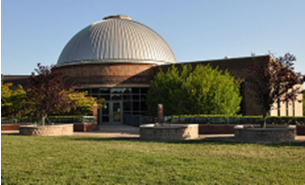
Herndon Fortnightly Community Library (Dranesville District)