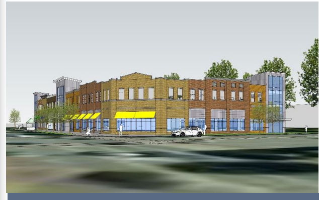
Patrick Henry Community Library & Garage-Partnership Project