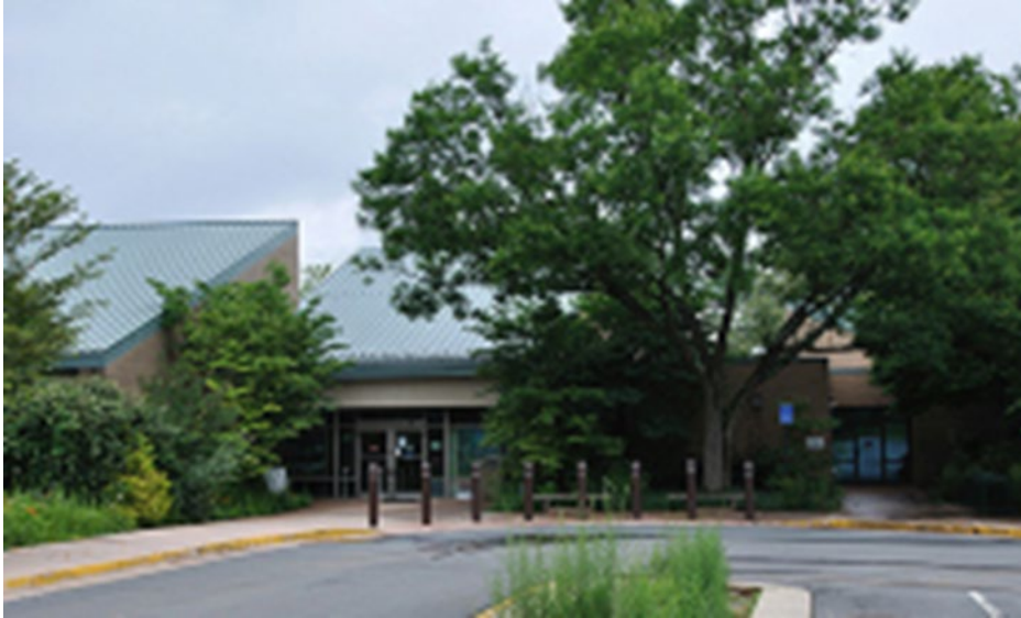
Kings Park Community Library (Braddock District)