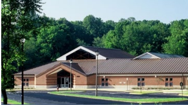
George Mason Regional Library