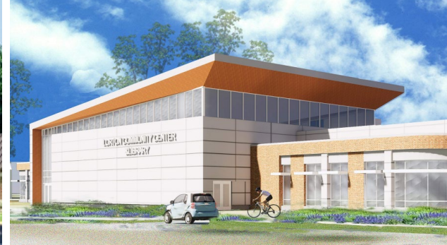
Lorton Community Library- Lorton Community Center Collocation