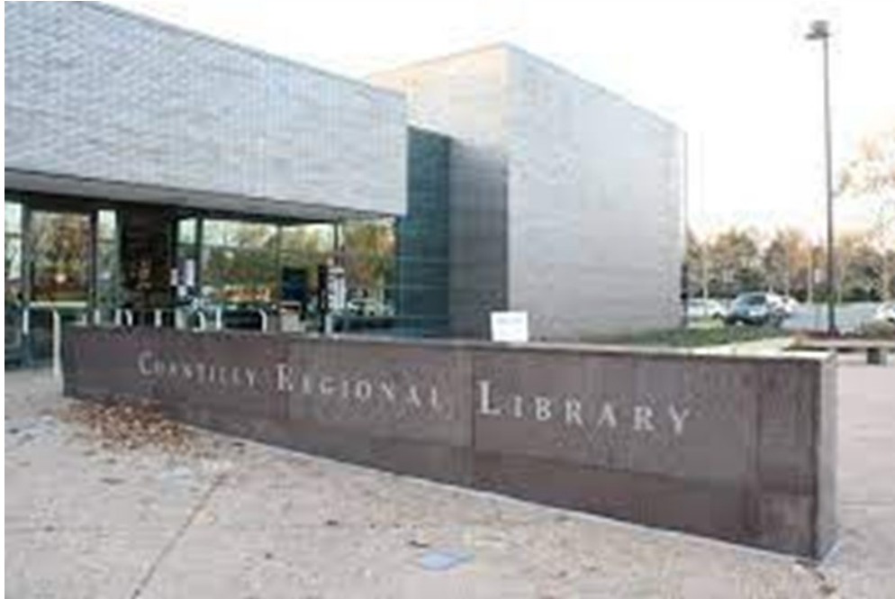
Chantilly Regional Library (Sully District)