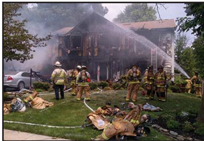
Firefighters responded to a fully involved house fire, June 18, 2014, in the Herndon area. An off-duty Montgomery County firefighter alerted the occupants of the home allowing them to escape unharmed. Damage was estimated at $350,000. Improperly discarded smoking materials caused the fire.