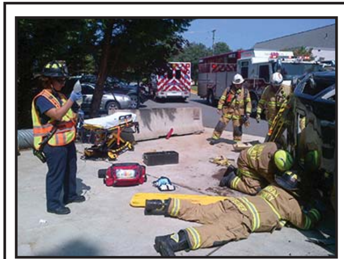
Firefighters from Fire and Rescue 12, Great Falls, conduct Safety In and On the Potomac (SIOP), during the month of August at Great Falls Park, raising awareness of water safety.