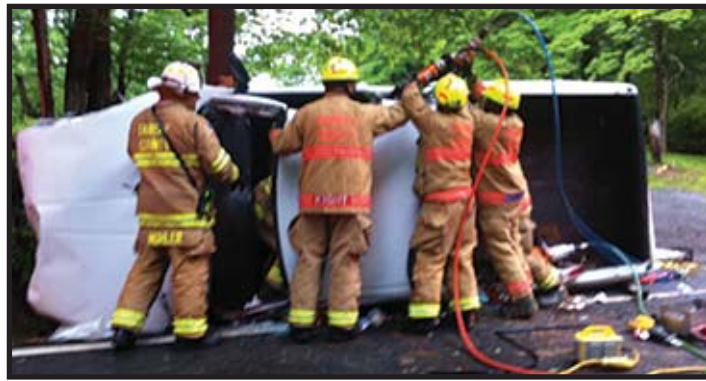
Crews from Clifton, Burke, and Fairview fire and rescue stations conduct an extrication on an overturned pickup truck on Chapel Road, June 5, 2014.