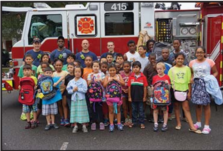
Firefighters from Fire and Rescue Station 15, Chantilly, drop off 50 backpacks and school supplies to kids at Ox Hill Baptist Church, near Chantilly Mews, August 22, 2014, a week prior to the department's large backpack giveaway at Fire and Rescue Station 11, Penn Daw.