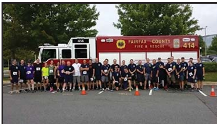
Department participants of the Crime Solvers 5K Run fundraiser gather around to celebrate winning the trophy for most participants in the race, August 2, 2014, near the Fairfax County Government Center.