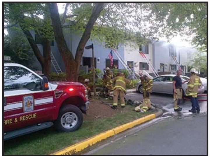
Firefighters responded to a end-unit townhouse fire, August 18, 2014, at 2052 Golf Course Drive, in the Reston area. All of the occupants escaped unharmed. Five occupants from two townhouses have been displaced. Damages are estimated at $180,000. The fire is under investigation.