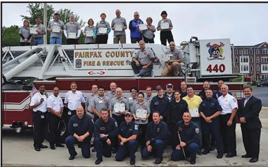
Crews from Fire and Rescue Station 40, Fairfax Center, pose with the recent graduates of the third Citizen's Fire and Rescue Academy, May 29, 2014.

From your normal shift schedule to incidents like the derecho, 9/11 and beyond, Fairfax County will depend on you being informed and ready to support our residents. The Office of Emergency Management is proud to work with the Fire and Rescue Department in this endeavor. ❖