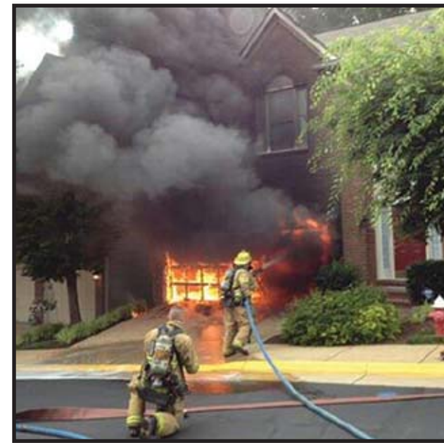
Crews from the second and fourth battalions and units from Fairfax City responded to a house fire, June 27, 2014, at 3450 Barristers Keep Circle in Fairfax City. A lone occupant was home when the fire broke out and escaped unharmed.