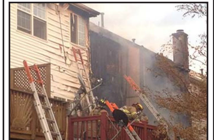
Firefighters battle a Herndon middle unit townhouse fire in the 2400 block of Wheat Meadow Circle, August, 10, 2014, at approximately 7:05 p.m. Improper disposal of smoking materials caused about $900,000 in damages, affecting six townhouses. There were no injuries.