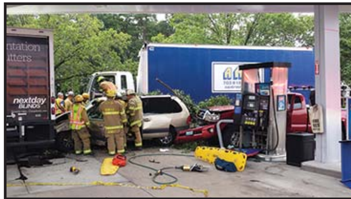
Firefighters from both Fairfax County and Fairfax City responded to a multi-vehicle crash at the Sunoco gas station, 10619 Braddock Road, at approximately 5 p.m., July 24, 2014. Two heavy rescue companies extricated several trapped victims in the five vehicle crash. Four patients were transported to INOVA Fairfax Hospital. Fuel pumps were shut down; however, there were no fuel spills.