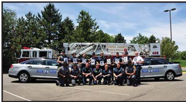
Firefighters from Fire and Rescue Station 8, Annandale, and Virginia State Troopers, bring attention to the "Move Over" safety initiative, June 2, 2014.