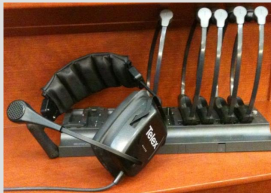
Figure 2/Figure 3

The project meets the primary objectives to improve citizens' access to the Courts, facilitate trials and hearings in the most effective and efficient means possible, allow for all three Courts to share common resources, and provide for flexibility and adaptability to incorporate future changes in technology and court proceedings.