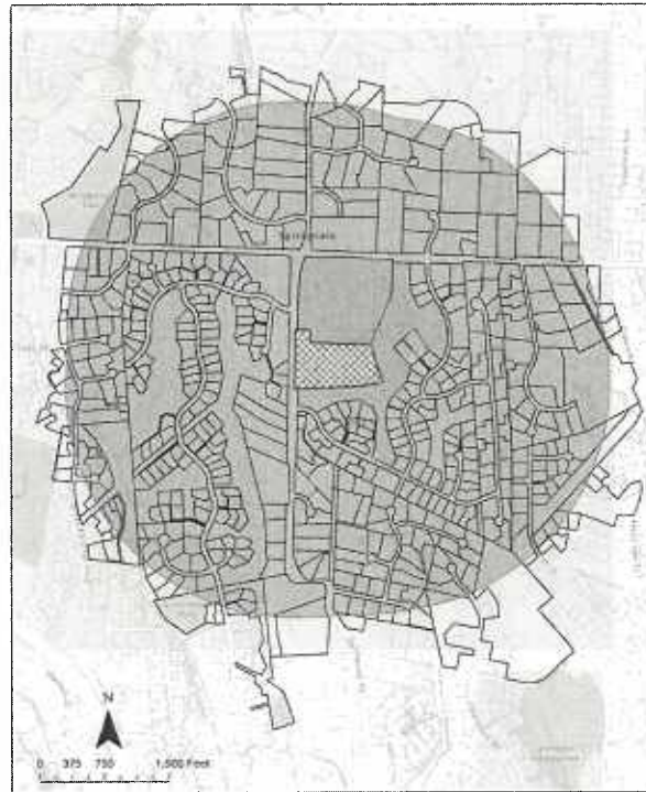
Figure 5109.5: Turner Farm Park Observatory Half-Mile Area

In addition to the other standards of this Section, properties located within one-half mile around the Turner Farm Park Observatory, as shown in Figure 5109.5 below, are subject to this subsection 5109.5. The one-half mile area is measured from the lot identified by Tax Map reference 12-1 ((1)) 24 as of November 22, 2023. If a lot is partially within the one-half mile area, these standards apply to the entire lot. The Applicability provisions in subsection 5109.1 also apply.