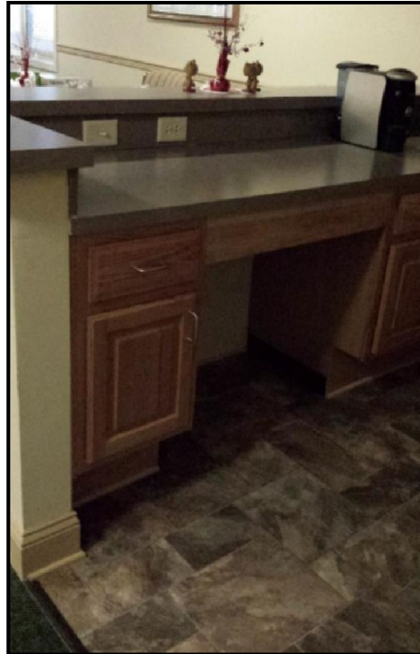
30" portion of the base cabinet was removed to allow for knee space.