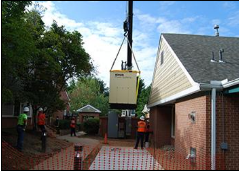
*Generator installation at Little River Glen