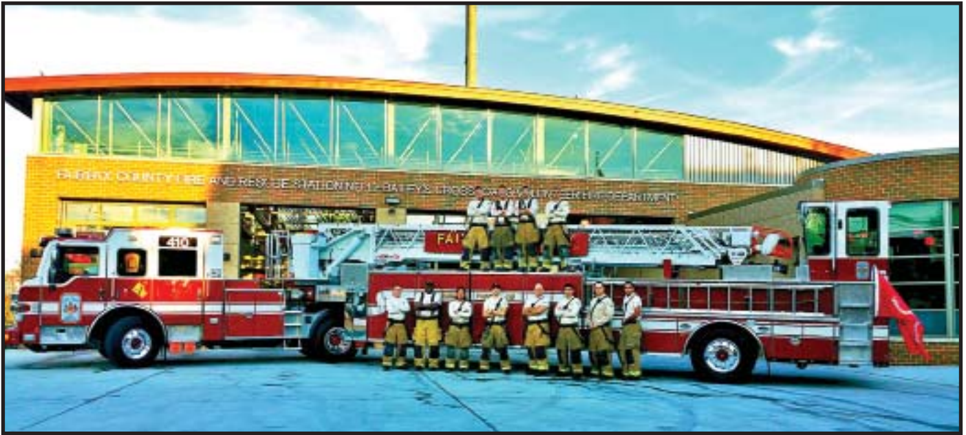
Firefighters from Fire and Rescue Station 10, Bailey's Crossroads, pose wearing their Veterans Day tee shirts honoring all veterans who have served past and present, November 11, 2015.