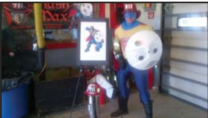
Fire & Rescue Station 11, Penn Daw