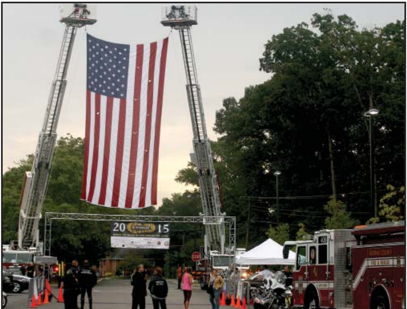
Crews from Fire and Rescue Station 9, Mount Vernon, and Fire and Rescue Station 24, Woodlawn, provide valuable support to the first 9-11 Heroes Run held in Alexandria. Over 900 participated.