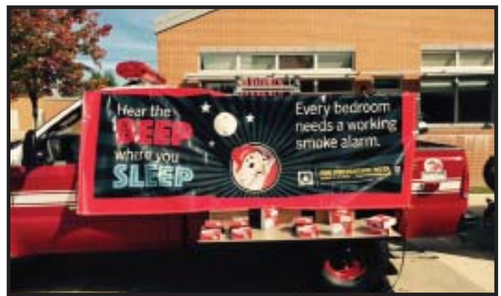
Fire & Rescue Station 41, Crosspointe