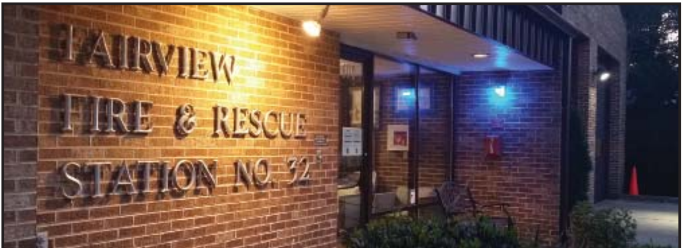
Fire and Rescue Station 32, Fairview, uses a "blue light" at the firehouse entrance to show solidarity and silent support with the Fairfax County Police Department.

Ultimately, I would love to see this show of solidarity spread throughout all of the Fire Departments within Northern Virginia. We need to continue to demonstrate to our LEOs that we support them! ❖