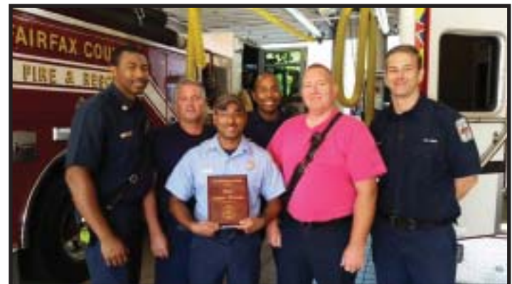
Fire & Rescue Station 11, Penn Daw