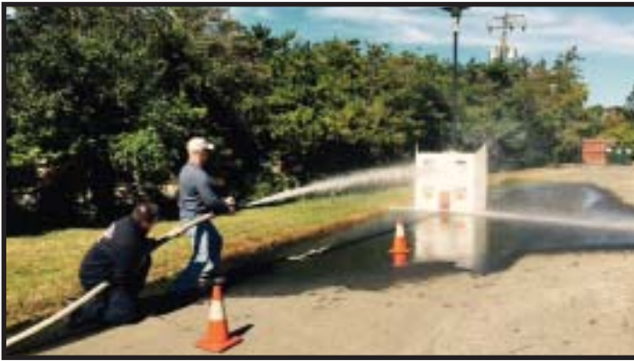
Fire & Rescue Station 23, West Annandale