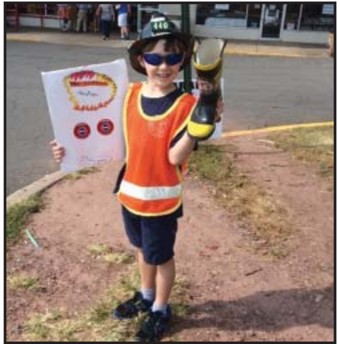
Fairfax County Fire and Rescue Department again collected the most money among fire department in the nation. The amount collected was $615,945 and broke the previous record for collections. A mighty thanks to all those who participated in the five-day event.