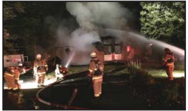
Firefighters responded to a fully involved house fire, September 29, 2015, at 12538 White Drive. The home was vacant and a total loss. The cause of the fire is under investigation.