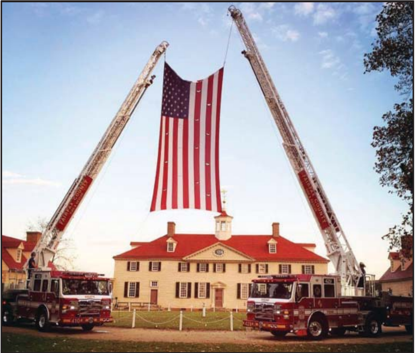
Tiller trucks from Fire Station 10, Baileys Crossroads and Fire Station 29, Tysons Corner, hoist the American flag at the Mount Vernon Estate on Veteran's Day.

decision making, emergency care and community outreach efforts must match the response environment. Just think if we had not made changes to these items over time and implemented SIOC. I am proud of everyone that had a part in saving these lives.