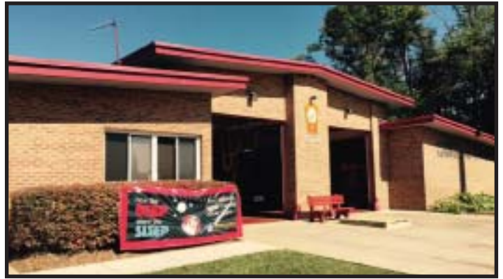
Fire & Rescue Station 23, West Annandale