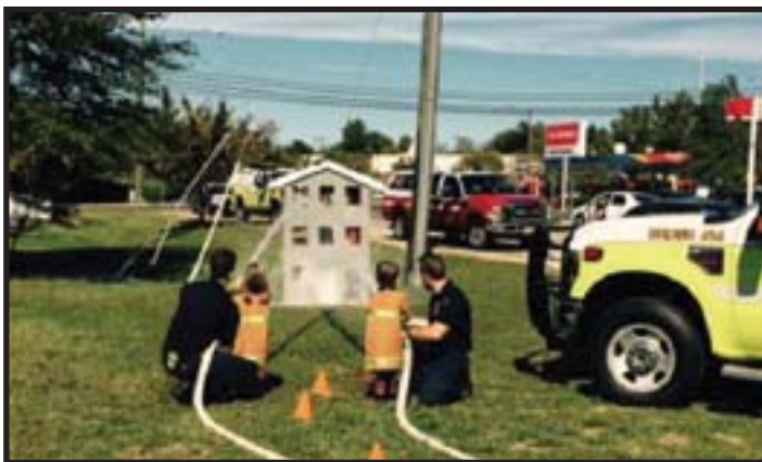
Fire & Rescue Station 14, Burke