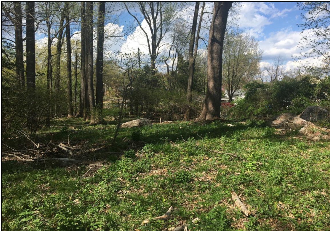
Native herbaceous vegetation germinating and establishing strongly in Unit 1 following seeding in Fall 2018. Photo was taken in Spring 2019.