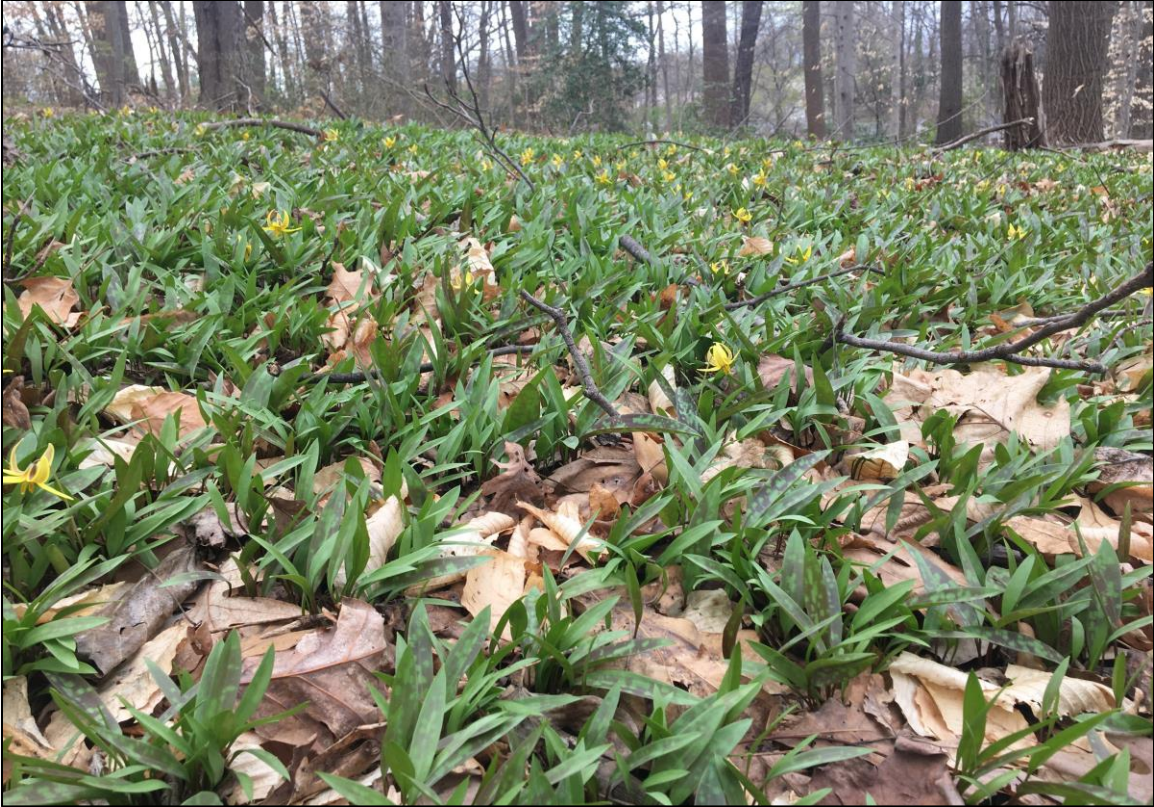
Large patch of native trout lily ( Erythronium americanum ) within undisturbed area of Fitzhugh Park.

Piedmont Prairie (CEGL006572): This is the only extant grassland community categorized by Virginia Division of Natural Heritage in the Virginia Piedmont. Occurrences of this natural community are semi-natural and have developed under a regime of frequent mowing and/or burning. Vegetation composition is very diverse, and characteristic species include Indiangrass ( Sorghastrum nutans ), little bluestem ( Schizachyrium scoparium ), narrowleaf mountain mint ( Pycnanthemum tenuifolium ), and early goldenrod ( Solidago juncea ).