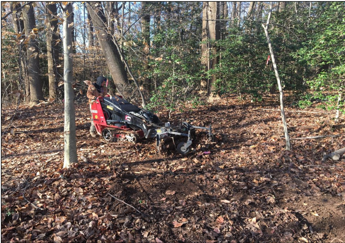
Harley rake being used to prepare soil for seeding in Unit 1. The machine creates a good seedbed for native herbaceous plants by exposing and fluffing the top ½ inch of mineral soil.