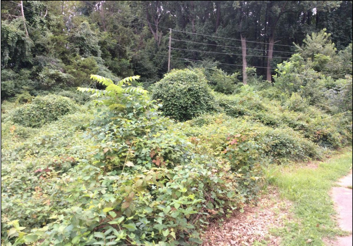
Heavy invasion of porcelain berry ( Ampelopsis glandulosa ) and low native plant cover and diversity in Unit 4 prior to restoration treatments. Photo taken in 2017.

A drawback of fall seeding is fact that there is a several-month gap between seeding and germination, and there is no living vegetation present to stabilize soils over the winter. There is added labor and materials cost to install erosion control measures. Erosion and seed washout may still occur if the site experience a heavy rainfall prior to seed germination.