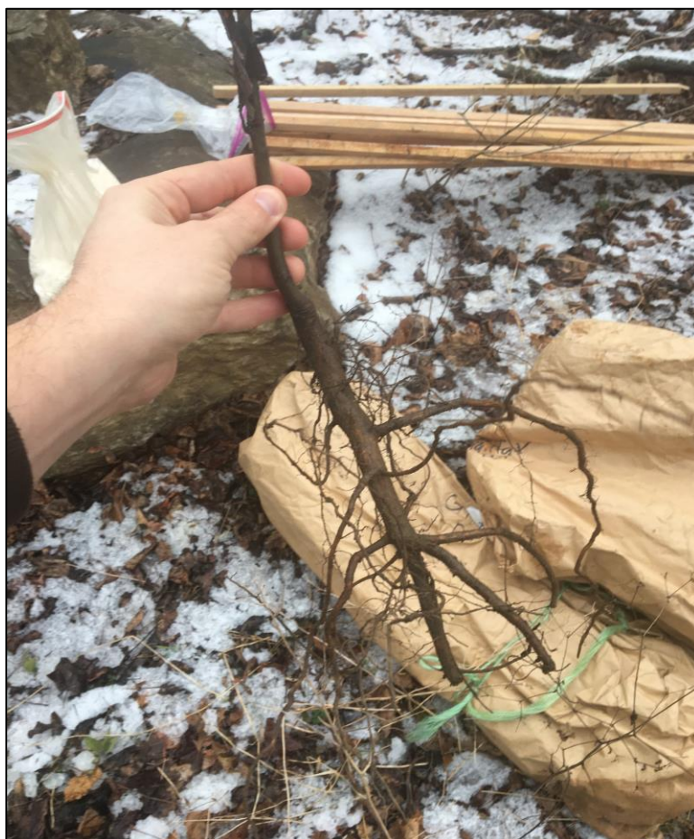
Vigorous root system of a bare-root white oak ( Quercus alba ) seedling. About 250 oaks were planted in Unit 1 in December 2020.