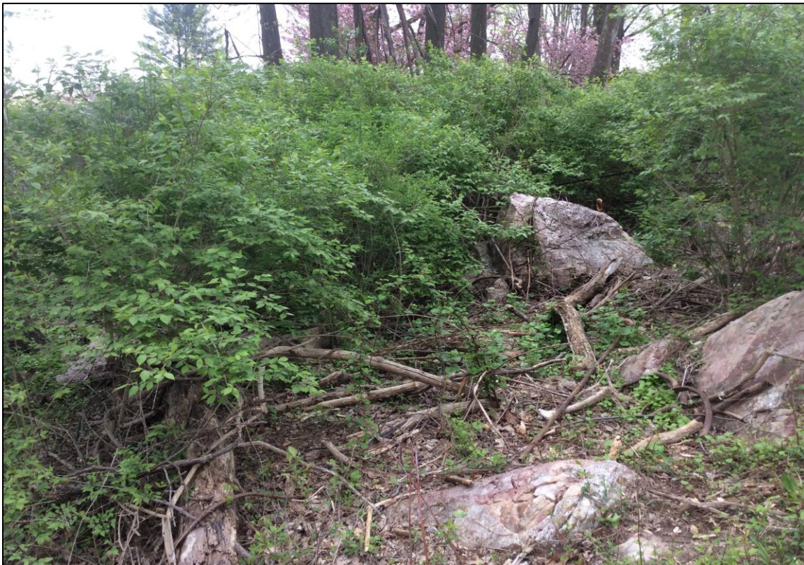
Heavy invasion of bush honeysuckle ( Lonicera maackii ) in Management Unit 1, with low cover and diversity of native understory plants. Similar conditions existed throughout Units 1, 2, and 3 prior to restoration treatments.