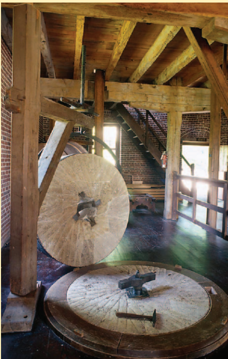
Colvin Run Mill