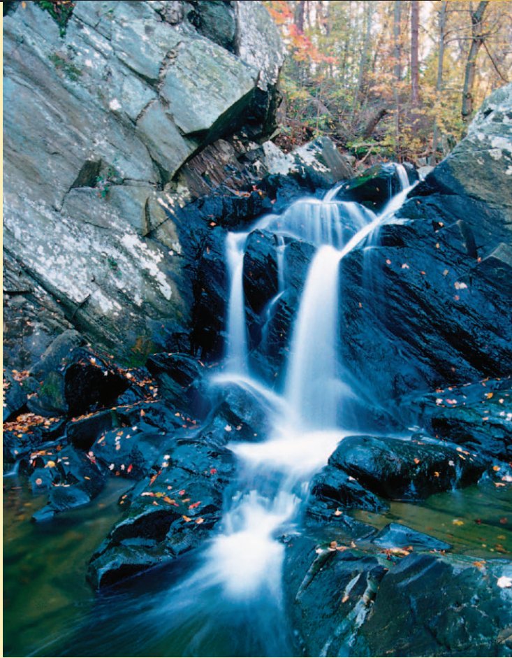
Scotts Run Nature Preserve