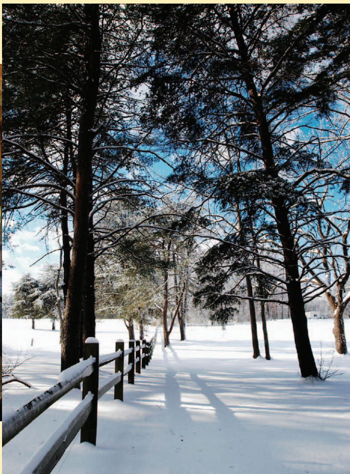
Burke Lake Park