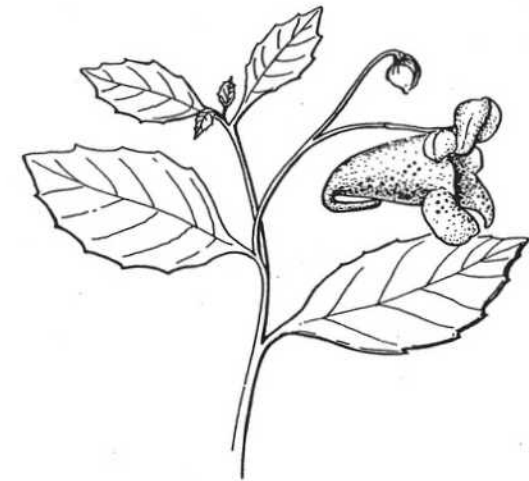
Cover: Jewelweed. Art by volunteer Terese Winslow.