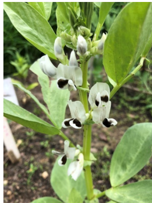
Fava Bean blossoms

Resources on Container Gardening can be found in the Resources list that covers raised beds and containers for vegetables.