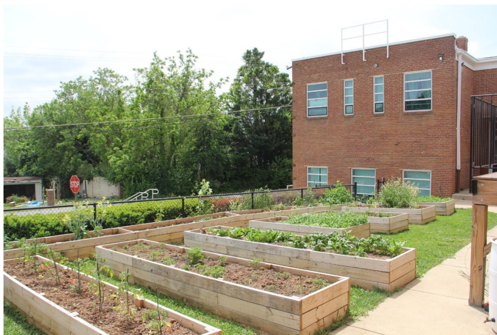
James Lee Community Garden, Falls Church, VA