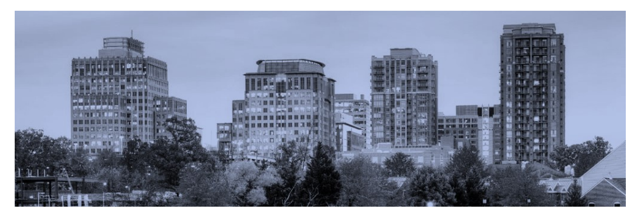
Population: 1.142 million | Land Area: 406 square miles