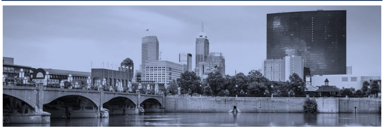
Population: 939,020 | Land Area: 403 square miles