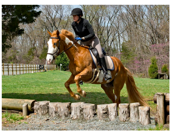
Riding or Boarding Stable