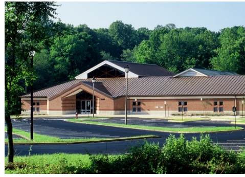
George Mason Regional Library