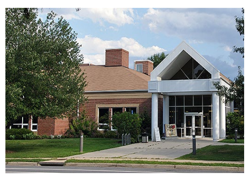
Sherwood Regional Library