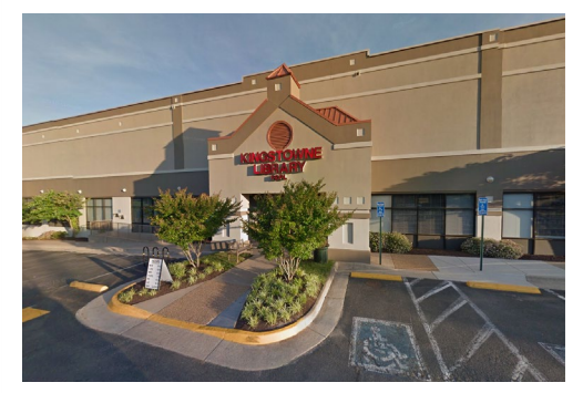
Kingstowne Regional Library