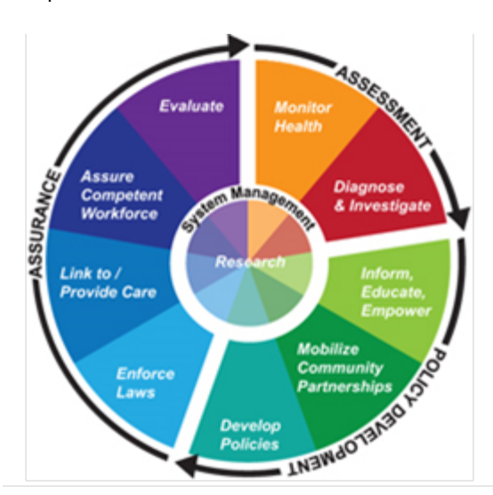
10 Essential Public Health Services

Communicable disease surveillance, prevention and control are core public health activities, accomplished through the provision of many department services by a diverse team of staff (physicians, nurses, laboratory scientists, epidemiologists, community health specialists, emergency planners, environmental health specialists, and others). Several methods are used to control the spread of communicable disease. These methods include testing and/or treating those exposed; immunizing whenever possible; improving infection control at health facilities; supporting social distancing between