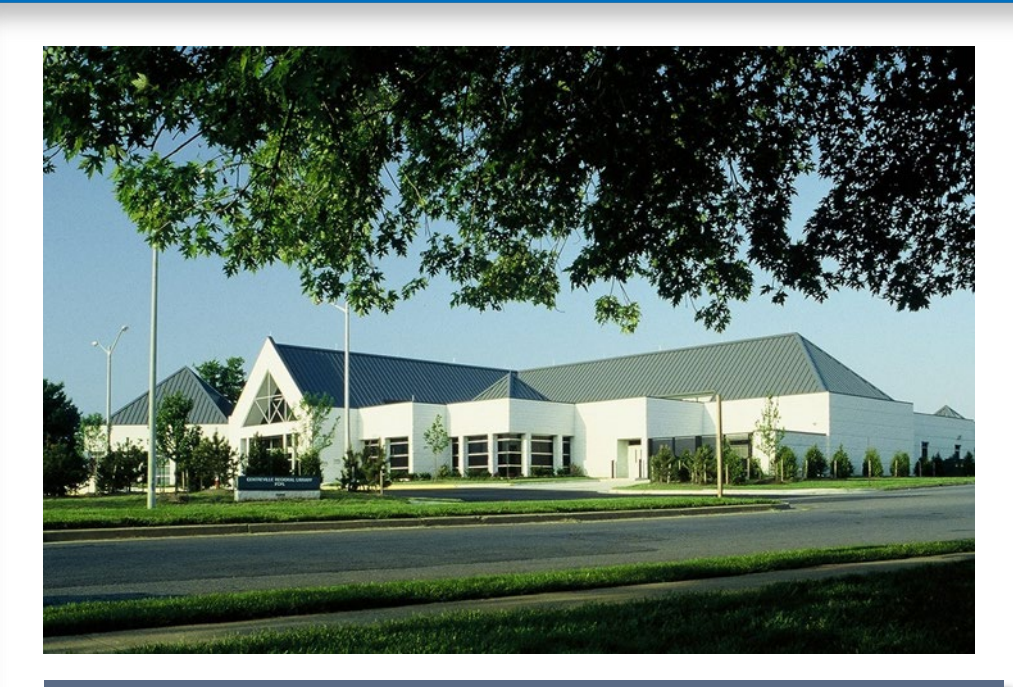
Centreville Regional Library (Sully District)