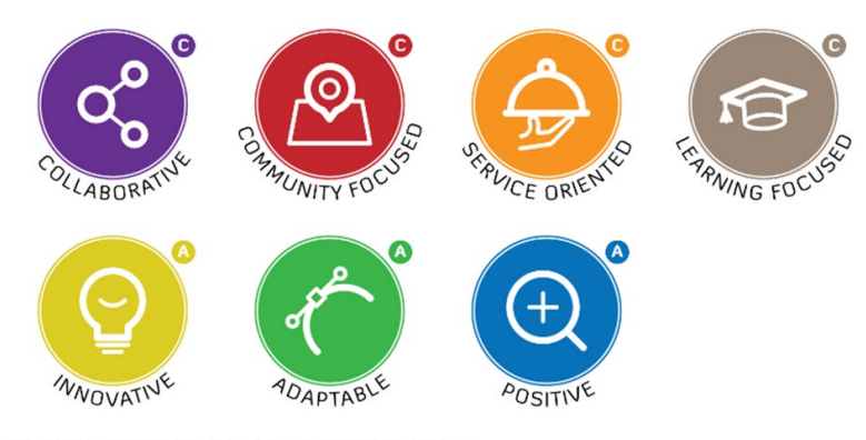
C indicates Core value. A indicates Aspirational value.