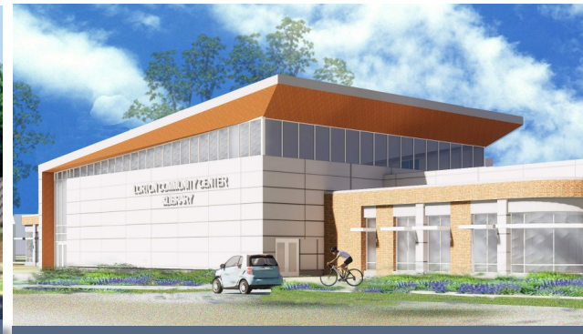
Lorton Community Library- Lorton Community Center Collocation