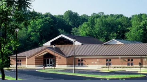
George Mason Regional Library