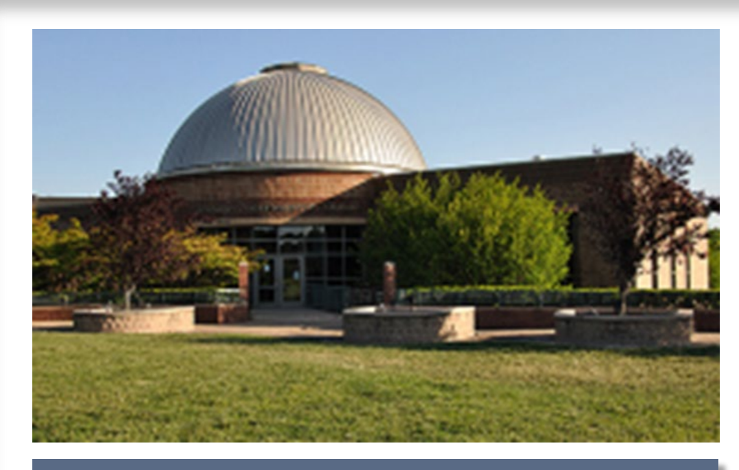
Herndon Fortnightly Community Library (Dranesville District)