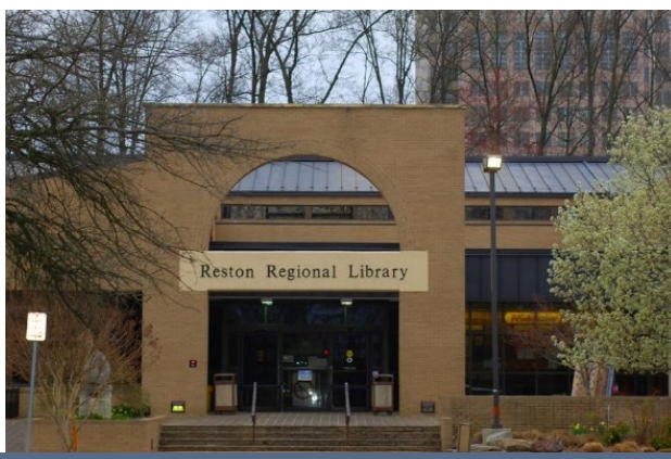
Reston Regional Library