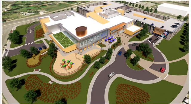
Kingstowne Regional Library- Collocated Facility