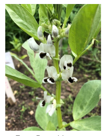
Fava Bean blossoms

Resources on Container Gardening can be found in the Resources list that covers raised beds and containers for vegetables.