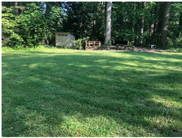
Future site of Good News Community Kitchen garden in Burke

If you can help, contact TGNCK at office@tgnck.org or fill out the volunteer application online.