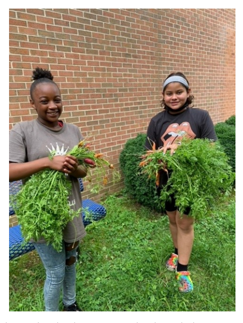
Mount Vernon Woods Elementary School students built their new shed and their own garden beds. They also harvested carrots in the summer and plan to build up their garden in the fall