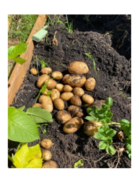
The spring garden featured a variety of cool season leafy and root crops such as lettuce, kale, radishes, onions, potatoes, carrots, and more. Ever eager to try something new, students this year planted and harvested a bountiful crop of potatoes.