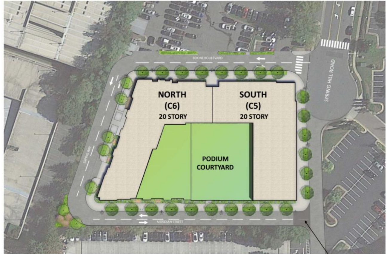
NORTH & SOUTH SITE PLAN

16,750 SF COURTYARD 30,800 SF FLOOR PLATE