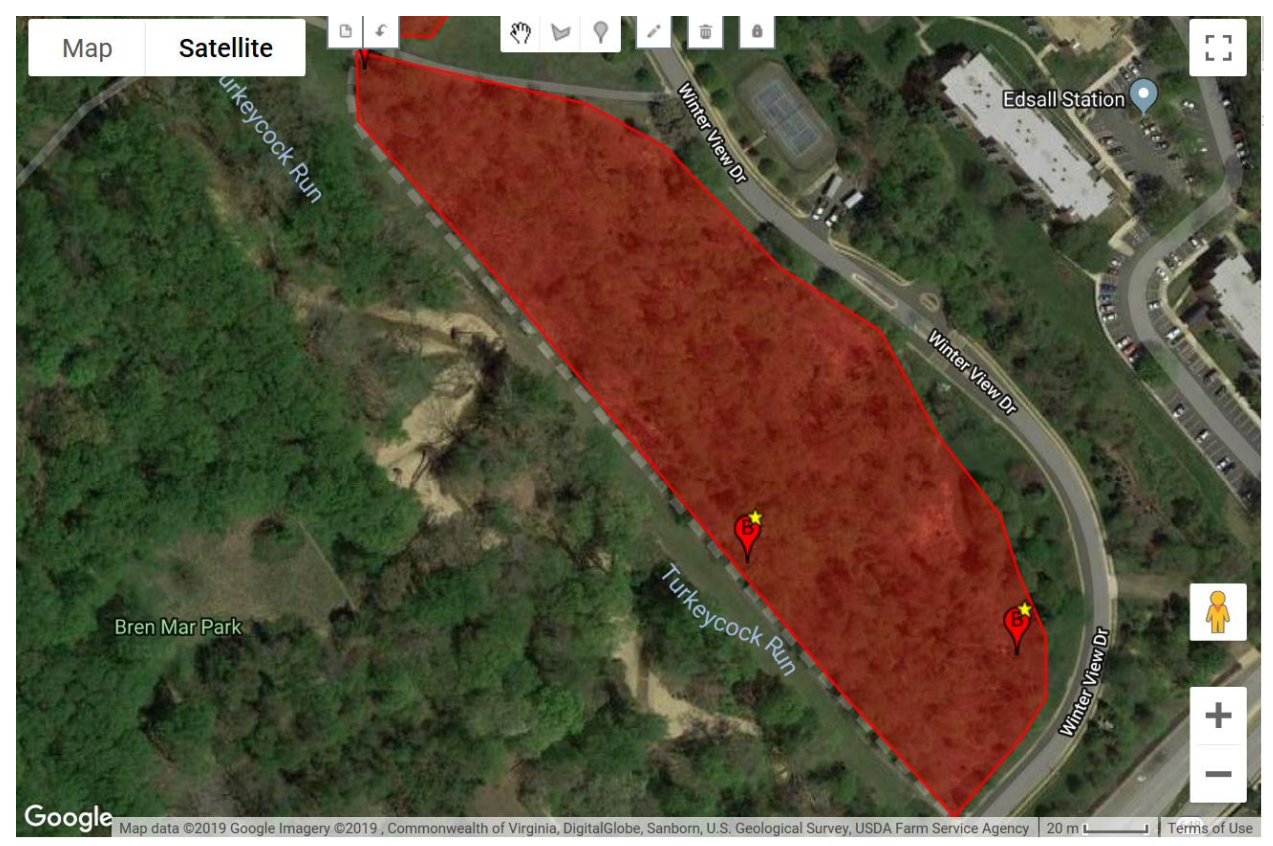
Bren Mar 2 2020