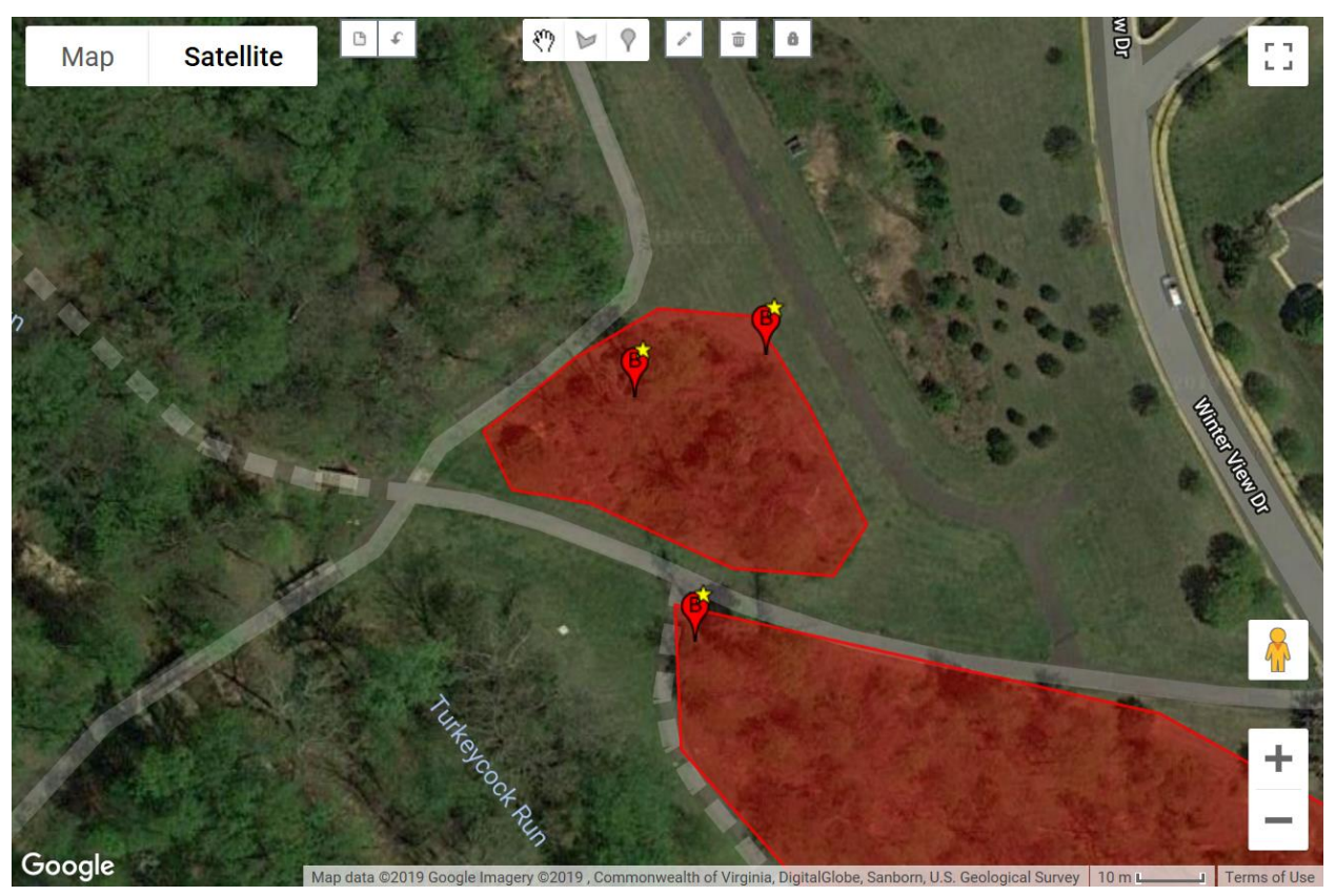
Bren Mar 1 2020