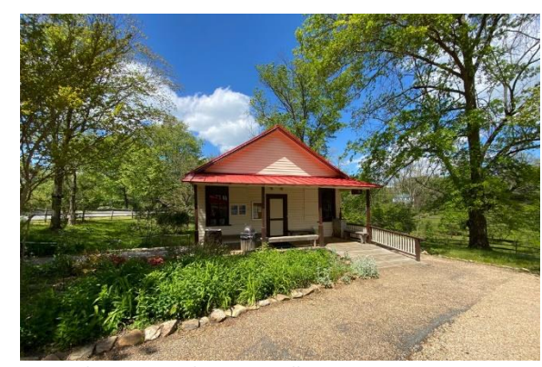
General Store at Colvin Run Mill

The General Store is the first building we will see. If the door is locked, we will ring the doorbell. This will let the staff working in other parts of the site know we are here. We might have to wait a few minutes for someone to let us in.