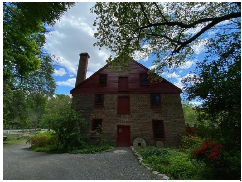
Colvin Run Mill

When I am ready to leave, I will tell the adult I am with. Together, we will walk back to the General Store. We will follow the brick path back to the parking lot.