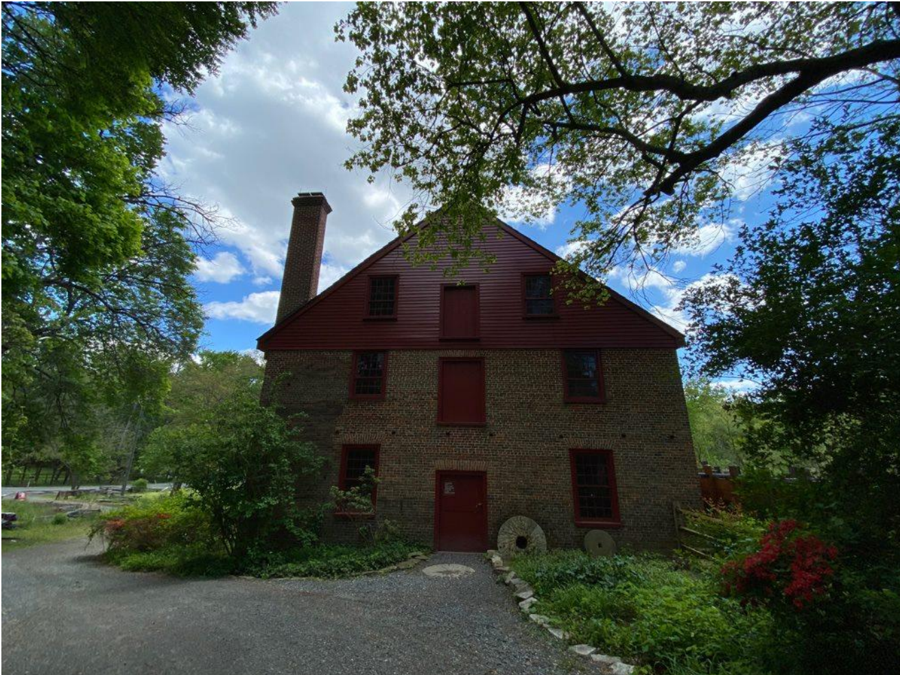
Colvin Run Mill

When I am ready to leave, I will walk back to the General Store. I will follow the same brick path I used to enter the site. This path will take me to the parking lot.