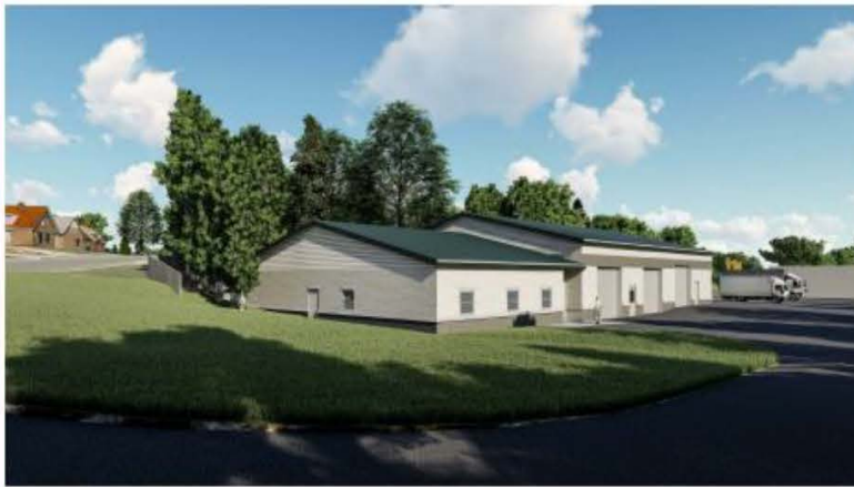
1 RENDERING SOUTH 11/15/17 12" = 1'-0"