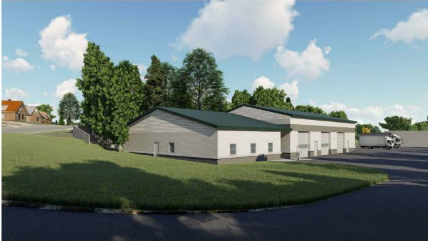
1 RENDERING SOUTH A11.01 1/2" = 1'-0"