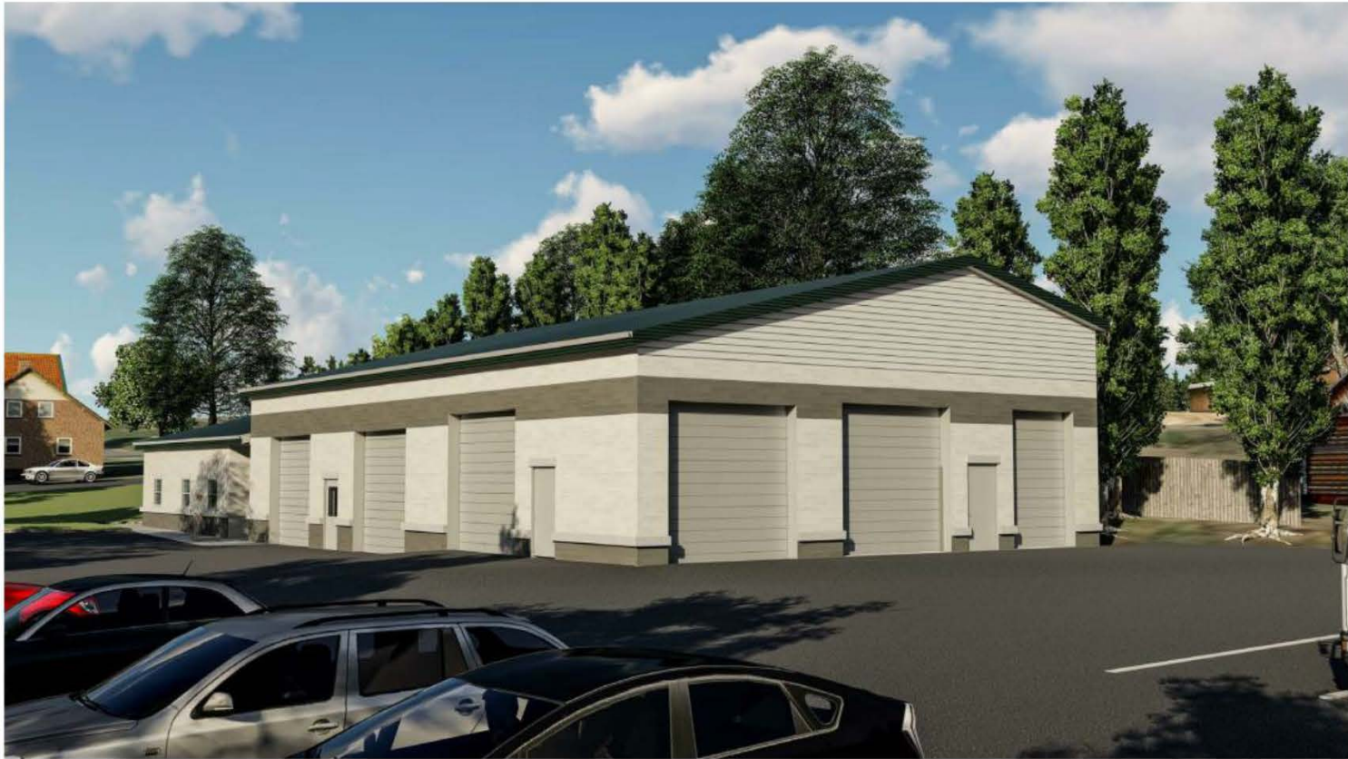
2 RENDERING NORTH A11.01 12" = 1'-0"