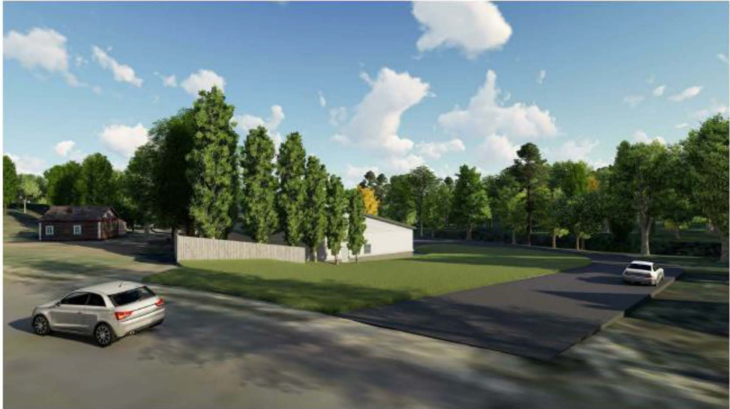
3 RENDERING EAST A11.01 1/2" = 1'-0"