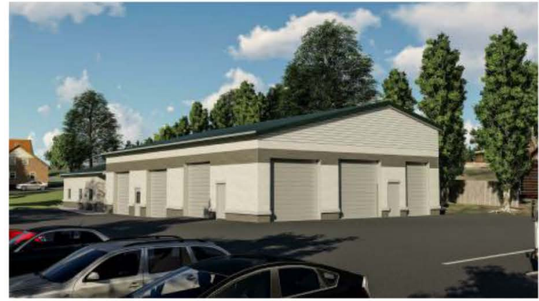
2 RENDERING NORTH 11/15/17 12" = 1'-0"