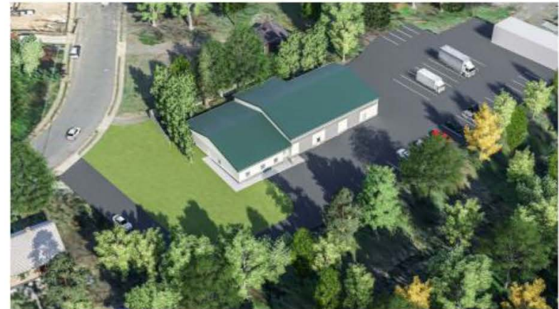
4 RENDERING AERIAL 11/15/17 12" = 1'-0"