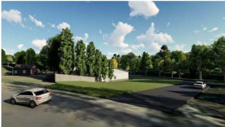
3 RENDERING EAST 11/15/17 12" = 1'-0"