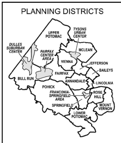
TYSONS URBAN CENTER