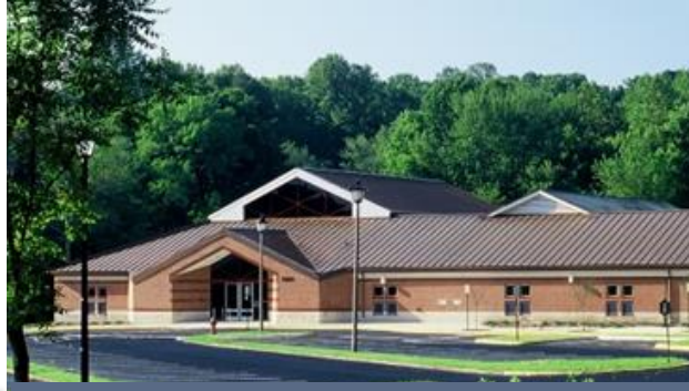
George Mason Regional Library