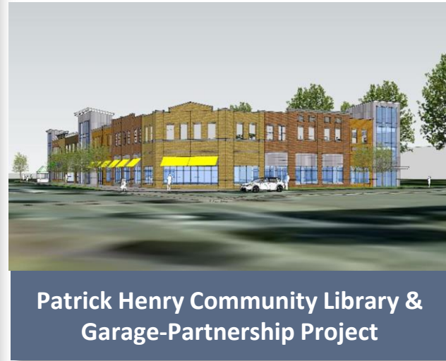
Patrick Henry Community Library & Garage-Partnership Project