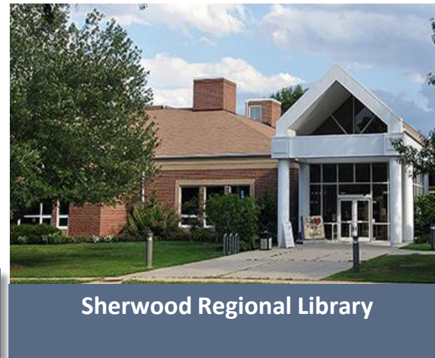
Sherwood Regional Library