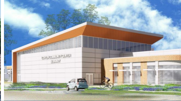
Lorton Community Library- Lorton Community Center Collocation