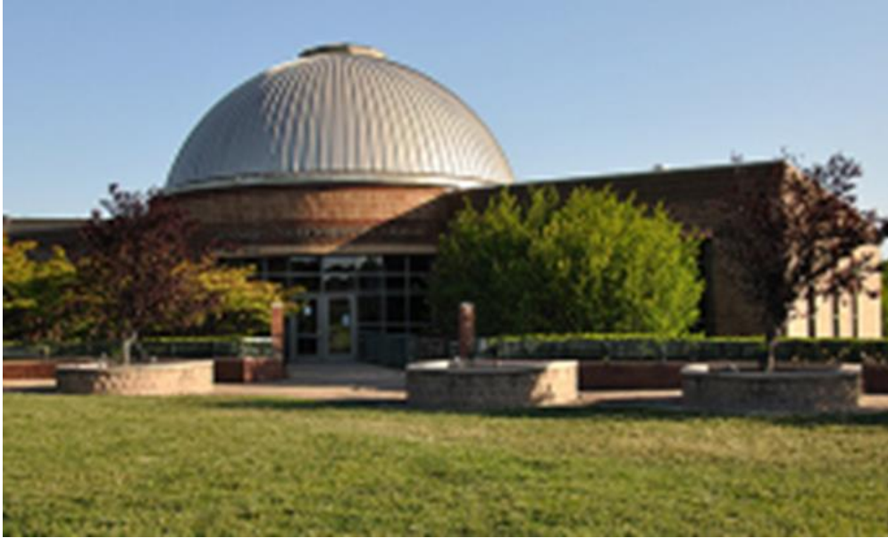
Herndon Fortnightly Community Library (Dranesville District)