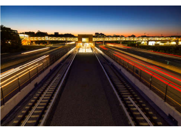
Wiehle Metro Station