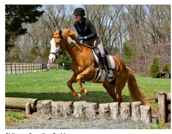
Riding or Boarding Stable