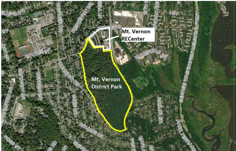
Existing Park Authority Parcel