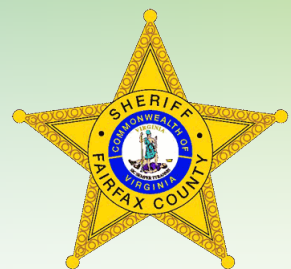
Fairfax County Sheriff's Office

Fairfax County is an Equal Opportunity Employer that does not discriminate on the basis of race, color, sex, creed, religion, national origin, age, disability, genetic information, veterans' status or disabled veterans' status.