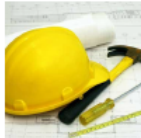
Board of Building & Fire Prevention Code Appeals (professional experience required)