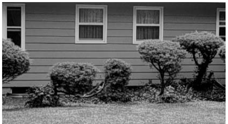
Figure 1. Browsing damage caused by repeated deer feeding on ornamental shrubs.

tors. Homeowners may consider it a nuisance when deer consume garden and landscape plantings (Figure 1). More importantly, an overabundance of deer may cause significant economic losses associated with decreased crops, vehicle collisions, or Lyme disease. Deer also affect forest ecology by feeding on preferred plants and altering the biodiversity in parks and natural woodlands. Human safety can be compromised because increases in deer-vehicle collisions are positively correlated with greater deer abundance (Blouch 1984, Etter et al. In press). For example from 1984 to 1994, as the deer population climbed in the community of Bellvue in Sarpy County, Nebraska, the number of deer-vehicle collisions in that county increased 325 percent (Hygnstrom and VerCauteren 1999). Conover et al. (1995) estimated that more than 1 million deer-vehicle collisions occur annually in the United States, and that annual vehicle repair costs from those accidents exceeded $1.1 billion. They further estimated that each year 29,000 human injuries and 211 human deaths occur as a result of deer-vehicle collisions. Although these numbers are low compared with other sources of human fatalities, they are of concern.