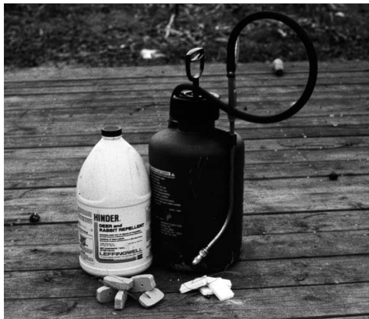
Figure 8. Several commercial repellents may reduce feeding damage for five or more weeks depending on deer foraging pressure and density.

Putrescent whole egg solids are the active ingredient in several odor-based, fear-inducing repellents (e.g., Deer-Away, Deer-Off, Deer Stopper, Big Game Repellent) that have been shown to be effective in