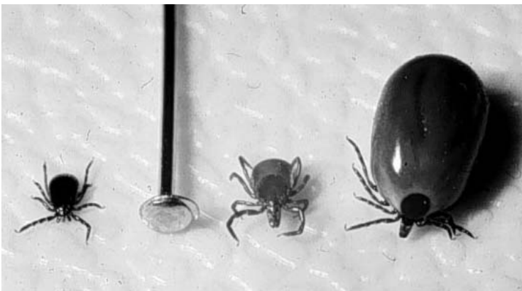
Figure 2. Male, female, and engorged black-legged ticks, with stick pin as reference.

Agricultural producers have indicated that deer cause more damage than other wildlife species (Conover and Decker 1991, Conover 1994, Wywiałowski 1994). Agricultural damage by deer was greatest in the northeastern and northcentral United States, with at least 41 percent of producers reporting damage (Wywiałowski 1994). Conover (1997) conservatively estimated annual deer damage to agriculture at $100 million.