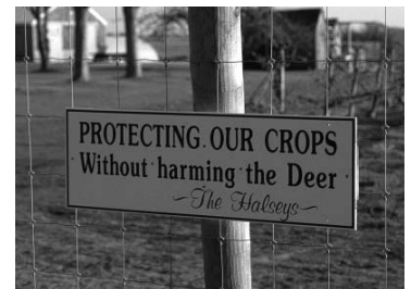
Figure 10. Woven-wire fences are the most effective way to protect large areas (>50 acres) of high value crops.