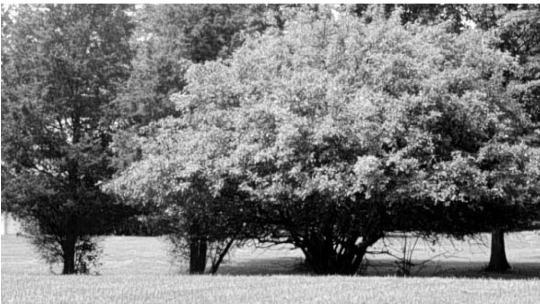
Figure 3. Overabundant deer remove vegetation to a height of approximately six feet, creating a browseline.