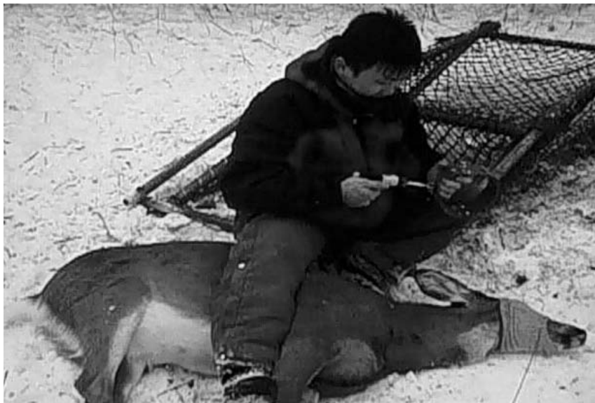
Figure 15. Using netted cages (Clover traps) for capture of deer

With any technique, the cost per deer handled will increase as the proportion of the population removed or treated increases (Rudolph et al. 2000). High costs associated with diminishing returns may prevent achieving population goals with some techniques. Deer learn to avoid threatening situations, and the use of a variety of methods to capture or kill deer can help maintain program efficiency.