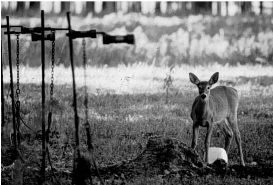
Figure 16. Rocket net positioned and ready for deer capture at a bait station

If capture and translocation is selected as the most appropriate management option, the following recommendations will minimize stress and subsequent capture myopathy during handling procedures. Only experienced personnel should be involved in deer handling or in the immediate area of the capture site. When physically restraining deer (i.e., net guns, drop nets, rocket nets, Clover traps) it may be advantageous to sedate each animal while extracting them