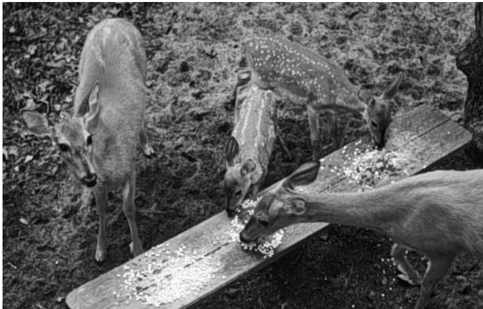
Figure 7. Feeding stations for observing deer may increase fawn production from adult females in good condition.

Repellents have traditionally been classified as odor- or taste-based products. Examples of odor-based repellents include products containing rotten eggs, soap, predator urine, blood meal, and other animal parts. Typically, these repellents are poured onto absorbent cloth or placed in a bag and suspended above the ground at densities of up to 1,150 bags/acre (Conover