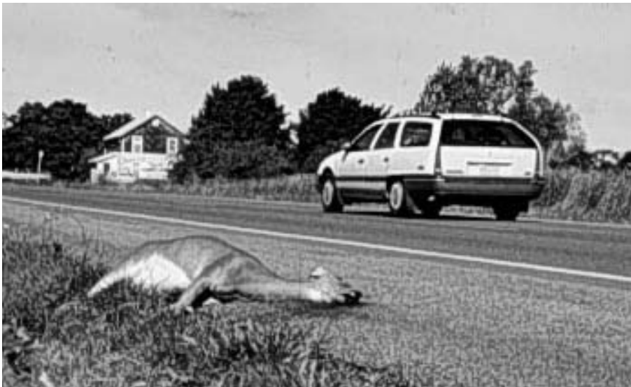
Figure 12. As deer densities increase in suburban areas, deer-vehicle collisions are occurring more frequently.

Deer-related vehicle accidents (Figure 12) are a major concern in some communities, and collision rates are apparently correlated with deer abundance. Several techniques have been used to reduce deer-car collisions, however few have been documented to be consistently effective, and some have no measurable effect on deer behavior.