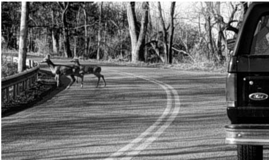
Figure 14. Deer often travel in family groups, so motorists should be cautious if one or more deer are seen on the roadside.

Highway departments install fencing along roadsides for many reasons in addition to preventing deer-vehicle collisions. The effectiveness of fencing for reducing numbers of deer-related accidents is limited unless properly maintained “deer-proof” fences are installed (Falk et al. 1978, Feldhamer et al. 1986). Romin and Bissonette (1996) reported that only ten states used fencing combined with overpasses/underpasses to lower deer-vehicle accidents, but more than 90 percent of state highway departments indicated fencing was effective for preventing animal-vehicle collisions. A 90 percent reduction in deer-vehicle accidents was achieved along a 7.8-mile section of I-70 in Colorado after the construction of an eight-foot-high deer fence (Ward 1982). Accident rates were also reduced in Minnesota (Ludwig and Bremicker 1983) and Pennsylvania (Faulk et al. 1978, Feldhamer et al. 1986) by constructing “deer-proof” fences. It appears that deer rarely jump nine-foot fencing (Feldhamer et al. 1986). Fencing must be frequently inspected with breaks or erosion gullies quickly repaired, because deer will find gaps or weak points where they can cross (Foster and Humhprey 1995, Ward 1982). Bashore et al. (1985) concluded that fencing was the cheapest and most effective method for reducing deer-vehicle collisions along short stretches of highway.