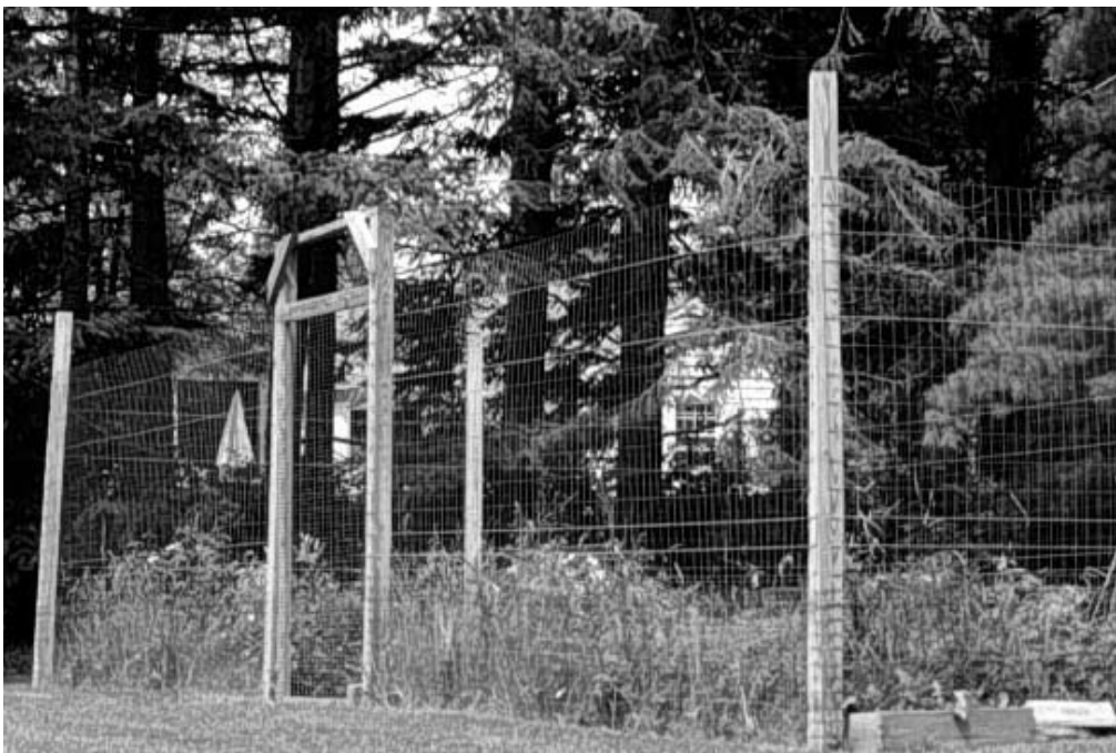
Figure 9. High-tensile barrier fence for protecting a home garden from deer damage

A wide variety of fencing systems, including baited single wires (Porter 1983, Hygnstrom and Craven 1988), three-dimensional outriggers (Tierson 1969), and slanted and vertical fences up to eleven feet in height (Longhurst et al. 1962, Halls et al. 1965, Palmer et al. 1985), have successfully excluded deer under some conditions. Often simple designs are effective only under light deer pressure (Brenneman 1983, McAninch et al. 1983) or for relatively small areas. Low-cost, easily constructed fences may perform quite well for small areas (less than ten acres) during the growing season when alternative foods are available to deer. Low-profile fences, however, are seldom satisfactory for protecting commercial orchards or ornamental plantings in winter, especially if snow restricts deer from using alternative food sources. Landowners must also check local ordinances and covenants to determine if electric fences can be used, or if fences of any kind can be constructed on their property.