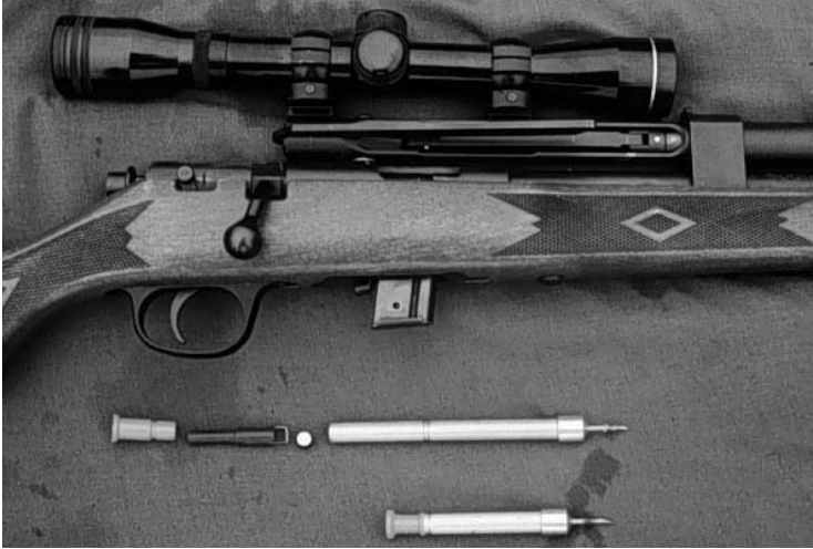
Figure 20. Dart rifle used for delivery of antifertility agents, vaccines, and immobilizing drugs