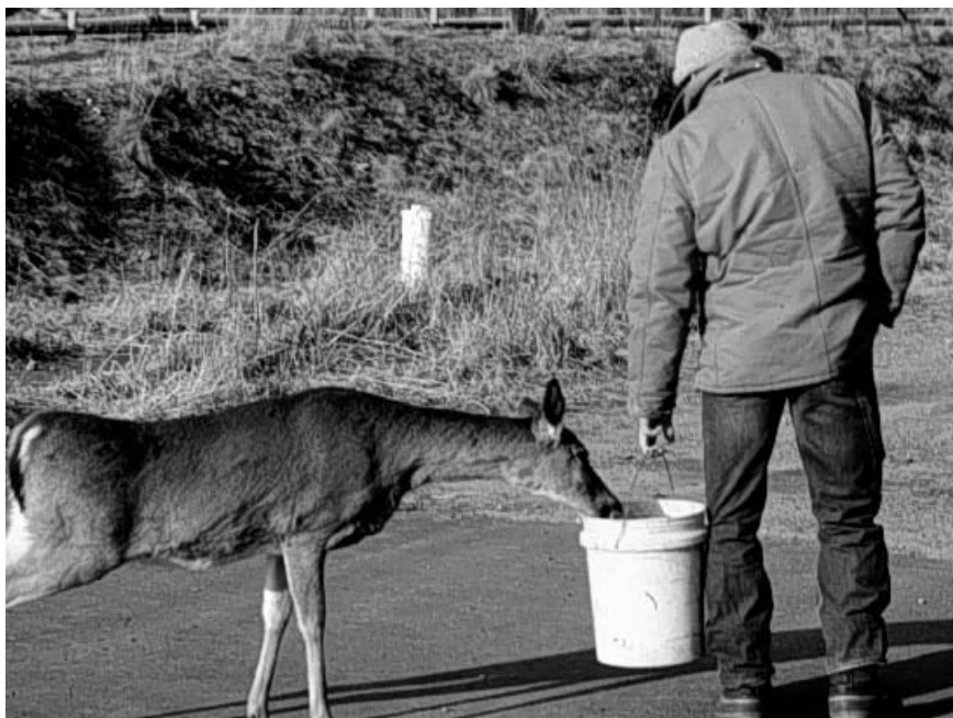
Figure 4. Feeding deer increases the potential for conflicts by making deer less wary of people.

White-tailed deer are extremely adaptable, both in habitat and diet selection. Deer are an edge species, faring well in transitional areas between forests, agriculture, grasslands, and even suburban landscapes. Forests, thickets, and grasslands provide deer with protective cover and natural foods, and agricultural fields can contribute abundant, high-quality forage. The diets of white-tailed deer often depend on the