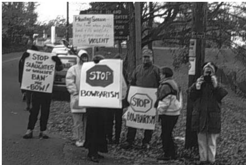
Figure 5. Animal activist groups may oppose controlled hunts, sharp-shooting programs, and other lethal forms of deer removal.

forces and similar transactional approaches (Chase et al. 2000, Curtis et al. 2000a). Communities are now sharing not only the decision-making authority, but also the cost and responsibility for deer management with state and local government agencies under a variety of co-management scenarios. The community scale is appropriate as deer impacts are often recognized by neighborhood groups, and the need for management becomes a local issue. In addition, the success or failure of management actions can be perceived most readily by stakeholders at the community level. Outcomes of co-management are usually perceived as more appropriate, efficient, and equitable than more authoritative wildlife management approaches. Although co-management requires substantial time and effort, this strategy may result in greater stakeholder investment in and satisfaction with deer management.