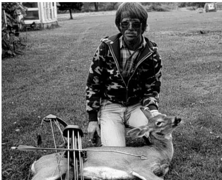
Figure 18. Bowhunters can remove deer from suburban locations where firearm hunts are impractical.

The potential for intervention and/or interference by activist groups is often high when using hunters to manage locally overabundant deer populations. Thus,