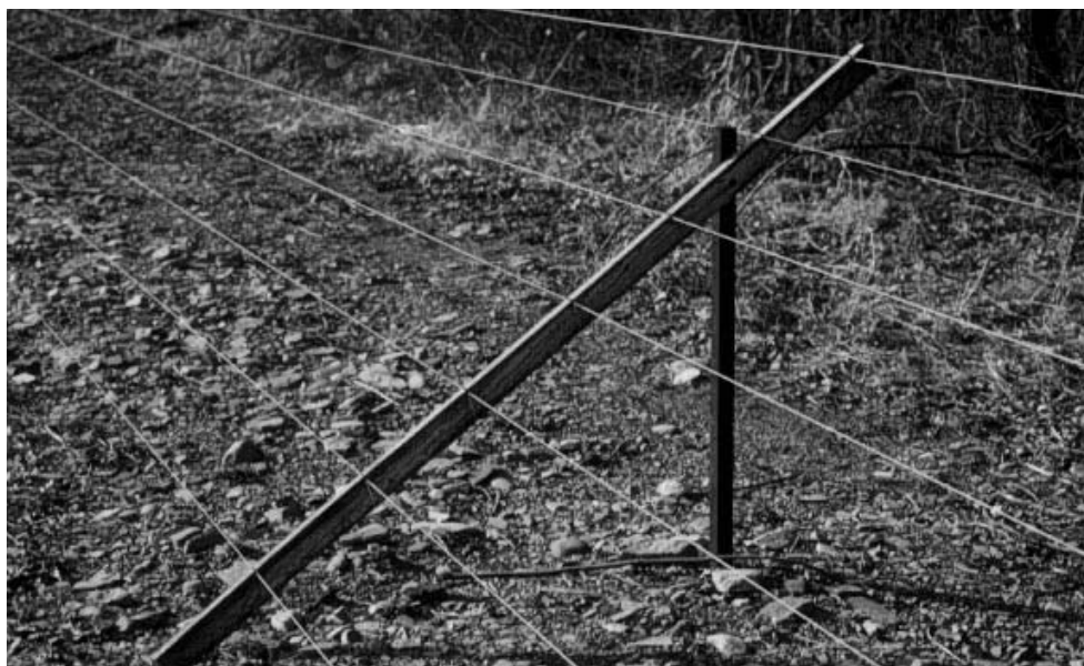
Figure 11. Deer have poor depth perception and will avoid areas protected by electrified, slanted-wire fences.

Multistrand, electrified, high-tensile, smooth-wire fences consist of several individual wires fastened to braced wooden assemblies, with wires tightened to 150 to 250 pounds of tension (McAninch et al. 1983, Palmer et al. 1985). Sturdy, well-braced corner and