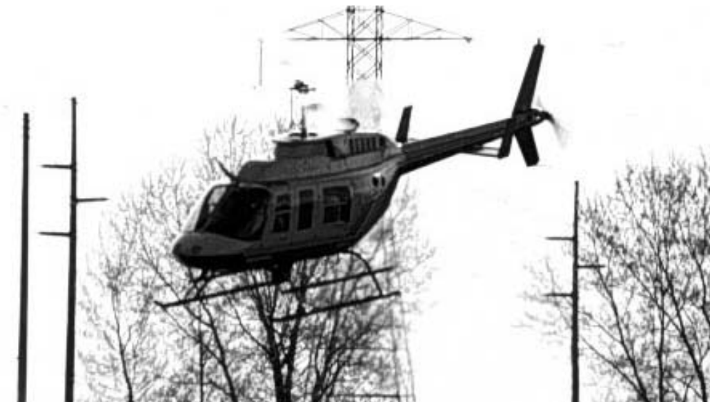
Figure 6. Helicopter surveys can be used to estimate deer abundance in areas with few conifers and four or more inches of snow cover.

To complement population estimates, the physical condition, mortality, and reproductive rates for deer should be monitored regularly to more accurately model deer populations over time. In the absence of population estimates, population indices (e.g., pellet-group counts, numbers of complaints or conflicts, etc.) may suffice as indicators of relative changes in deer abundance.