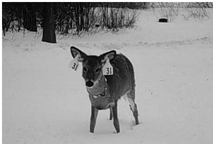
Figure 19. Cattle ear tags and radio collars are used to individually mark deer that are included in a research project.

The FDA has concerns about the safety of consuming deer treated with experimental drugs and currently requires that all treated, free-ranging deer be marked with warning tags (Figure 19) that stipulate consumption restrictions. It is not clear if or when FDA restrictions on consumption of deer meat treated with experimental drugs will be modified. In addition, fertility control agents are usually delivered to deer using either dart rifles or biobullets. Restrictions on firearms discharge in suburban areas often limits practical delivery of drugs to free-ranging deer. Consequently, there are many aspects of the regulatory and commercialization process and delivery systems that still need to be developed before contraceptive vaccines can be a viable management alternative for communities with overabundant deer herds.