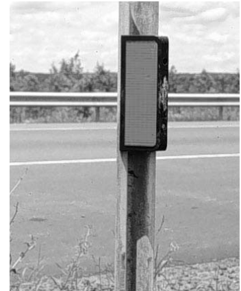
Figure 13. It is not clear that roadside reflectors will consistently reduce deer-vehicle accidents.

Wildlife warning whistles (deer whistles) attached to cars have been used in an attempt to reduce deer-vehicle collisions. These whistles operate at frequencies of 16 to 20 kHz and are intended to warn animals of approaching vehicles. There is no research,