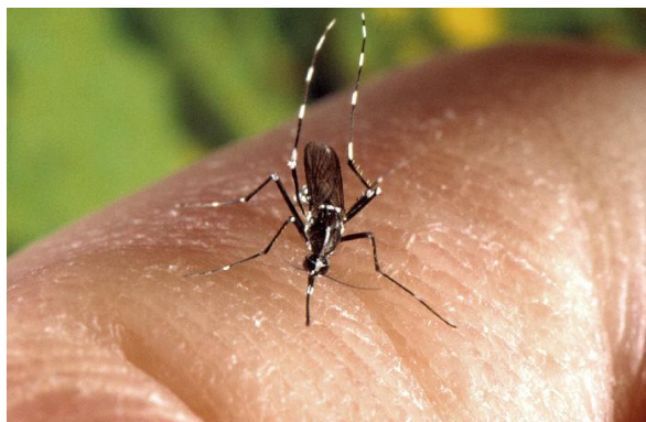
A female Asian tiger mosquito ( Aedes albopictus ), the main nuisance mosquito found in Fairfax County, and a potential vector of viruses like Zika and West Nile.

In addition to WNV and Zika, VDH's reportable disease list includes other mosquito-borne illnesses: dengue, chikungunya, yellow fever, eastern equine encephalitis, LaCrosse encephalitis, St. Louis encephalitis and malaria. The Health Department's Division of Epidemiology and Population Health investigates reported cases of these illnesses and notifies the DCIP. The DCIP conducts entomological investigations for these cases as appropriate, providing education, information and controlling mosquitoes as necessary to protect public health.