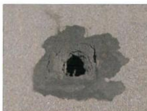
Improper road patch