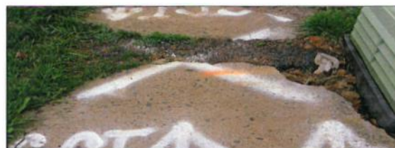
Sidewalk, driveway & Other property damage