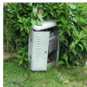
Open or unlocked cabinet