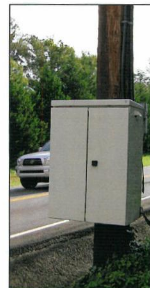
Cable box too low

If you see a problem, contact us! We will send out an inspector.