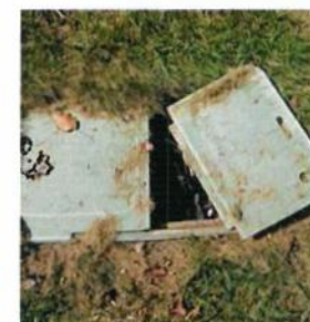
Open underground vault lid