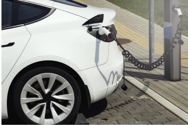
A vehicle is being charged at an electric vehicle charging station (EVCS). There is a EVCS permit fee exemption available through October 31, 2025.

A new GIS application was created to let the public see the distribution of Electric Vehicle Charging Station (EVCS) permits across Fairfax County for the first 12 months of the trial period. This application overlays the location of LDS Commercial and Residential Electrical Permits for EVCS against the Fairfax County Vulnerability Index Map to show equity impacts.