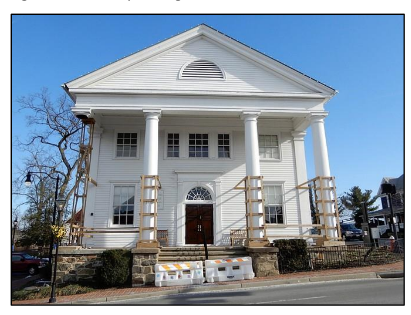
Fairfax Old Town Hall, 2022

columns of the building collapsed into the street, and it has since remained closed. Good news came just this week, however, as the City announced that repairs to the columns and other structural elements would begin! We look forward to seeing the building serve once more as a gathering place, for lively community events and celebrations in Fairfax.