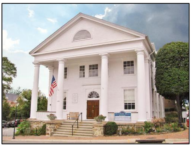
Fairfax Old Town Hall, 3995 University Drive, Fairfax, Virginia

Happy Spring, and welcome back to Found in the Archives ! The Historic Records Center is pleased to announce that we are now once again fully open and receiving walk-in researchers. Researchers who wish to make an appointment are still welcome to do so, but appointments are no longer required. We are also excited to announce we are resuming our weekly, guided tours of the Historic Courthouse every Friday at 3 p.m.; those who are interested can meet at the green doors at the 1799 Courthouse entrance, where the tour begins.