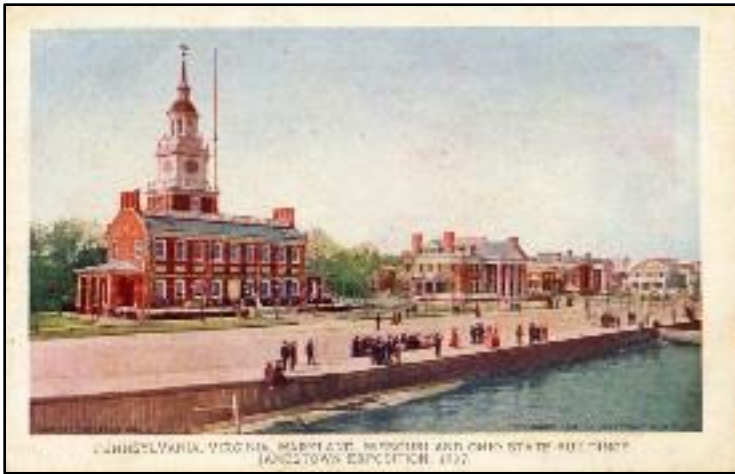
Jamestown Exposition Postcard, 1907

near Alexandria. The Virginia State House can be seen second from left in the above image.