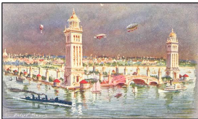
Jamestown Exposition Postcard, 1907

One of our current projects at the Historic Records Center is a re-inventory and re-housing of our loose documents, collectively known as "Drawer X." Among the deeds, wills, estate accounts, petitions, marriage bonds and other court documents are records that at first glance look rather ordinary, but, upon closer inspection, reveal forgotten or little-known events and facets of Fairfax County life.