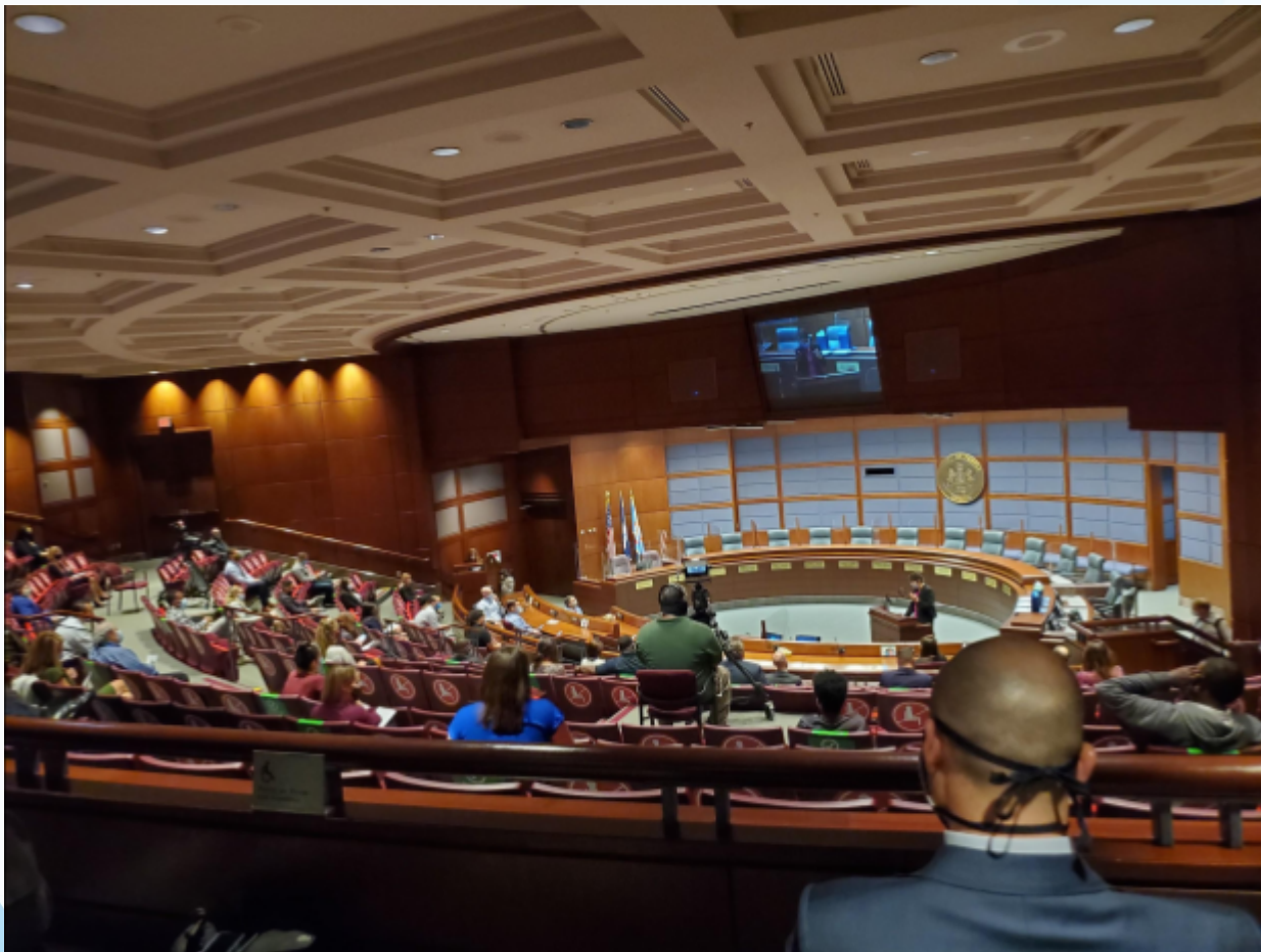
CA Descano at the first ever graduation of Drug Court. (Sept. 24, 2020.)

Mental Health Court: The Mental Health Docket is aimed at addressing mental health and co-occurring substance abuse issues amongst defendants at various stages in the criminal justice system. Since first created in 2018, over 150 individuals have been connected with services through this docket