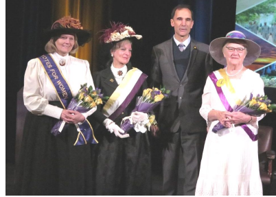
The Suffragist Ladies at the Town Meeting.