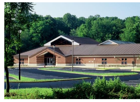
George Mason Regional Library