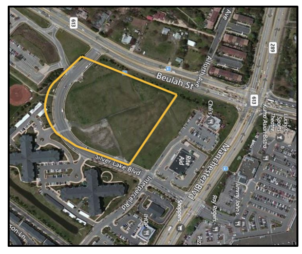
Kingstowne Site (6.74 acres) Beulah St. & Silver Lake Blvd.