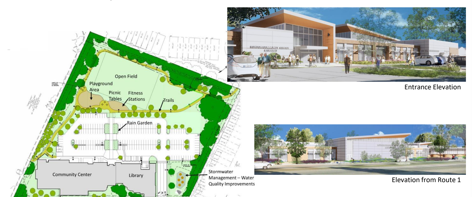
Proposed Site Plan – Currently in design