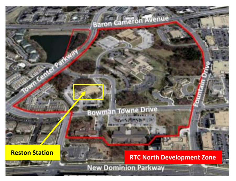
Example of future high-rise threat