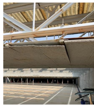
Existing Firing Range