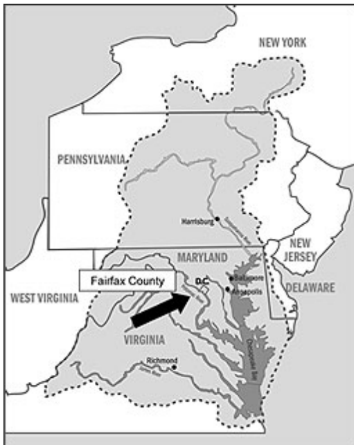
Figure 1.2 The Chesapeake Bay watershed

Streams and rivers may flow through many different types of land use in their paths to the ocean. In the above illustration from the U.S. Environmental Protection Agency, water flows from agricultural lands to residential areas to industrial zones as it moves downstream. Each land use presents unique impacts and challenges on water quality.