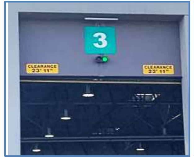
Bays 1 through 11 and bay 21 are 23' 11". Bays 12 through 20 are 25' 5".

This Solid Waste Advisory (SWA) is a reminder of bay door height restrictions at the I-66 Transfer Station. Not all bays have the same clearance. Any customer entering the tipping building, especially those that raise their vehicles up in order to dump, should be aware of the height restrictions.