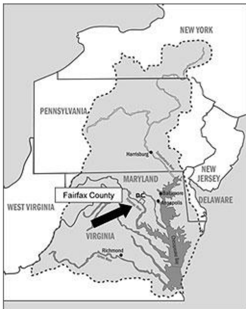
Figure 1-2: The Chesapeake Bay watershed

Streams and rivers may flow through many different types of land use in their paths to the ocean. In the above illustration from the U.S. Environmental Protection Agency, water flows from agricultural lands to residential areas to industrial zones as it moves downstream. Each land use presents unique impacts and challenges on water quality.