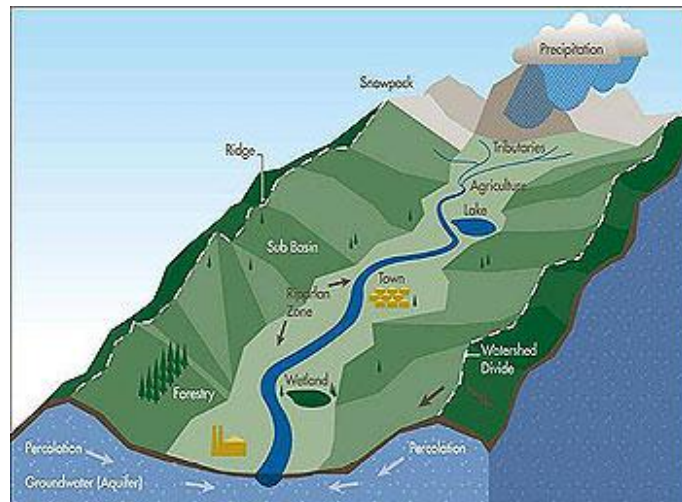
Figure 1-1: Diagram of a watershed

The boundary of a watershed is defined by the watershed divide, which is the ridge of highest elevation surrounding a given stream or network of streams. A drop of rainwater falling outside of this boundary will enter a different watershed and will flow to a different body of water.