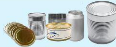
METAL FOOD AND BEVERAGE CANS