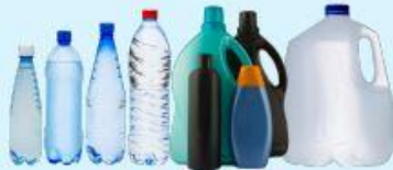
PLASTIC BOTTLES AND JUGS (LIDS ON)