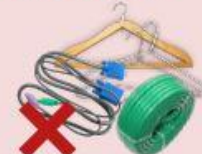
HANGERS, HOSES AND CABLES