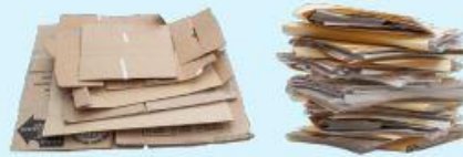
MIXED PAPER AND CARDBOARD

*For specialty items such as food containers like tubs, clamshells and other plastics, please contact your hauler.