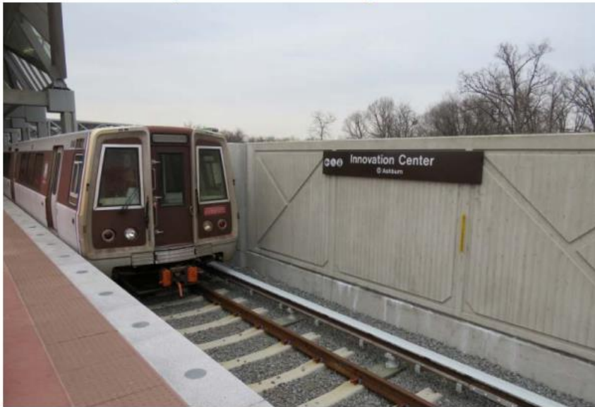
First Test Trains for Dynamic Testing on Phase Two Guideway