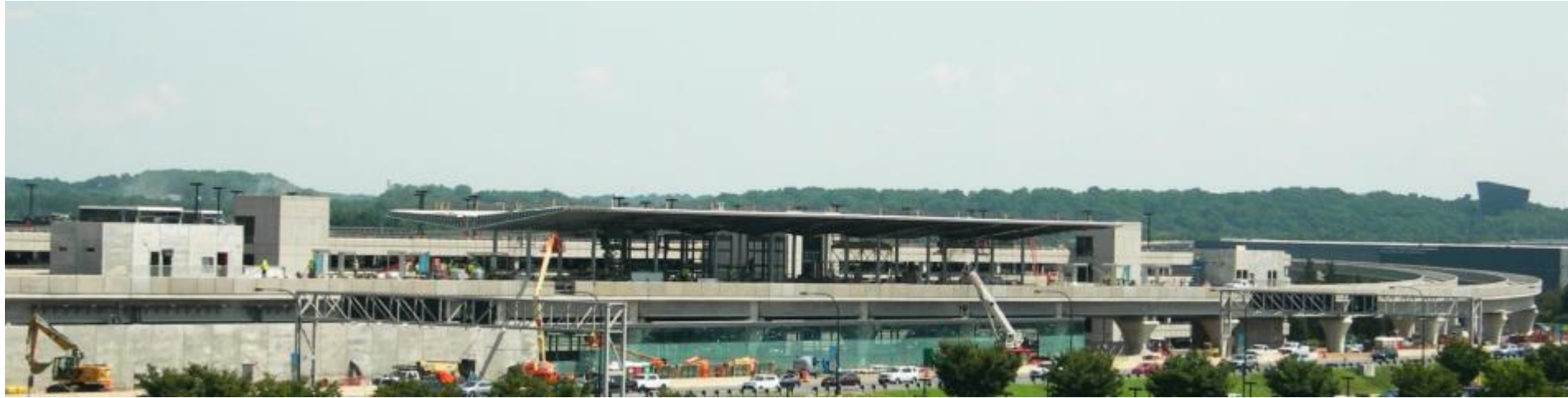
Installing Framing and Panels Over Gates at Dulles Station