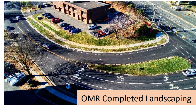
OMR Completed Landscaping