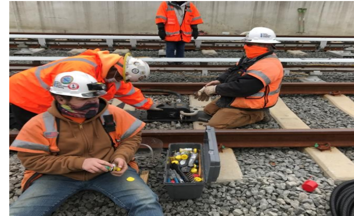
Negative Cross Bond Rework