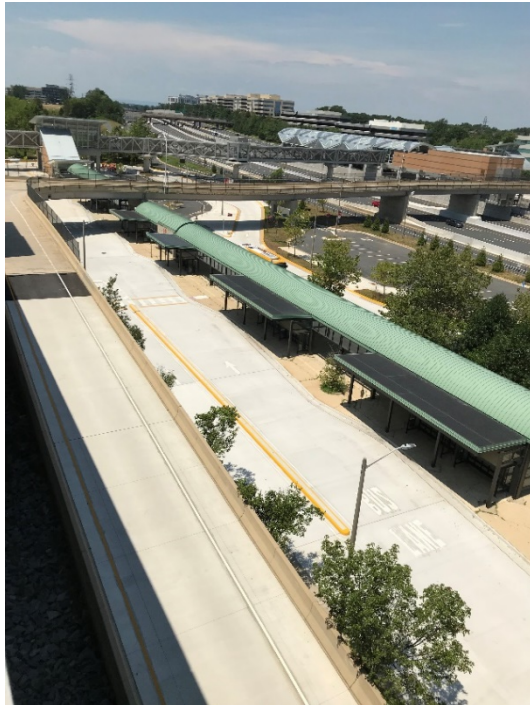
Herndon Bus Loop