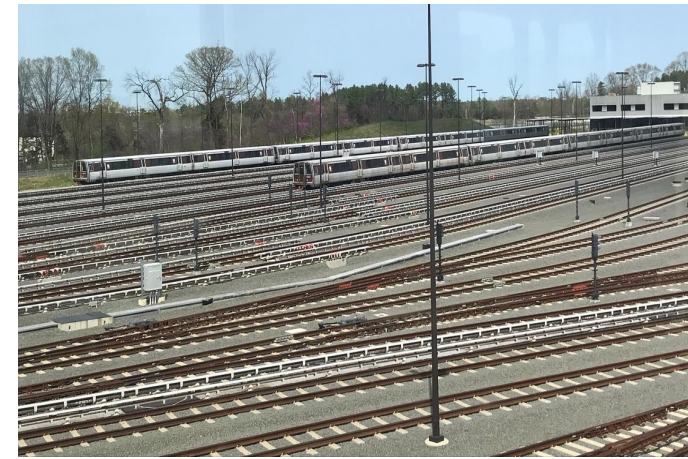
Trains at Rail Yard for Testing