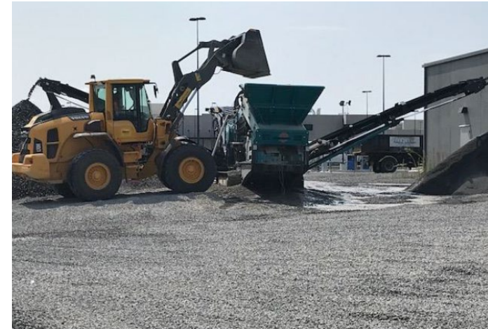
Screening Ballast to Remove Fines