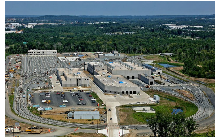
Dulles Rail Yard