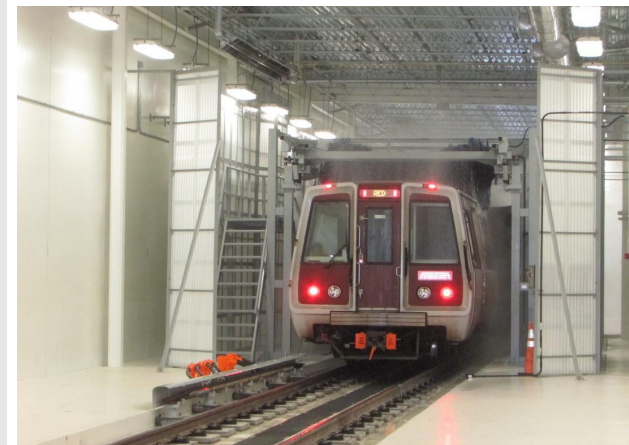
Train Wash Testing