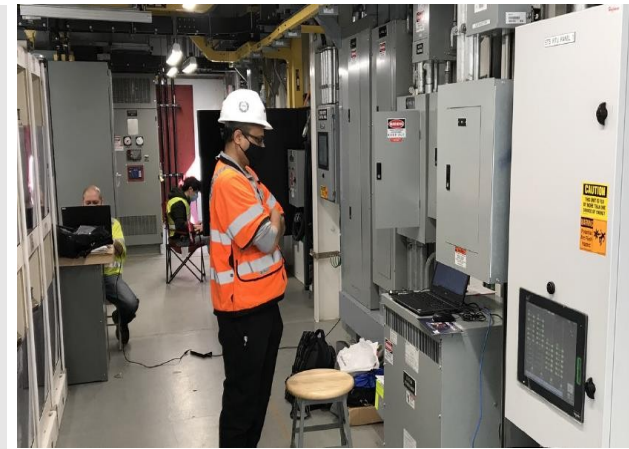
Traction Power Substation Low Voltage Testing