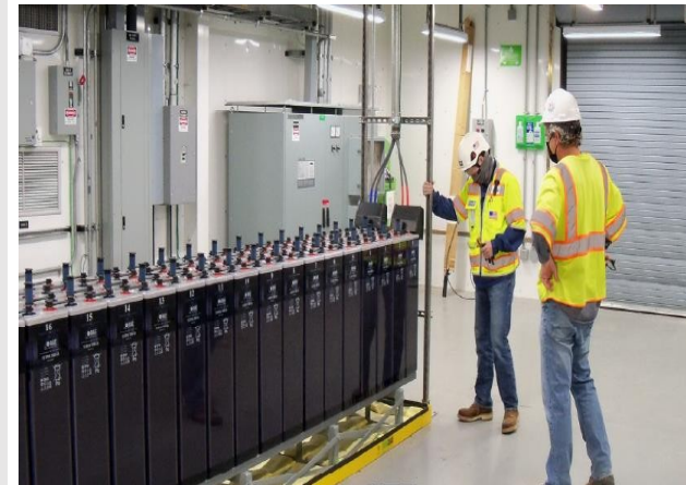
Performing Final Battery Inspections