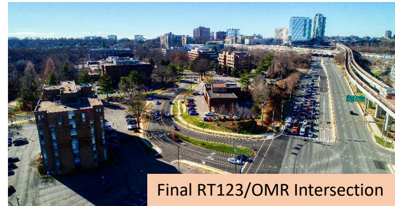
Final RT123/OMR Intersection