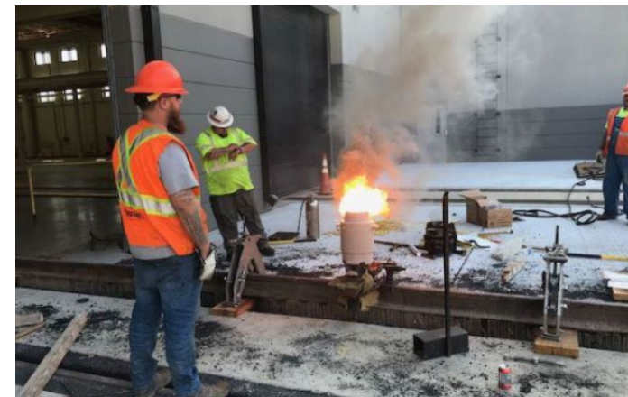
Thermite Welding Replacement Insulated Joint 'Plug' in Place