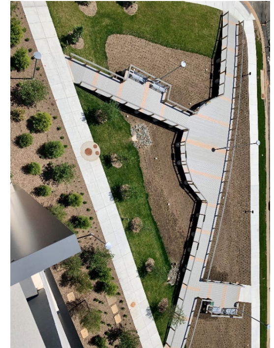
Bioretention pond & boardwalk