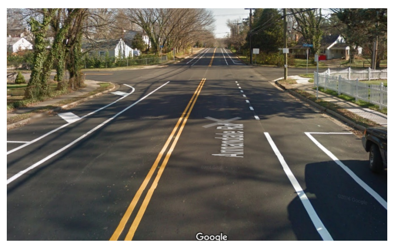
Top speeds virtually eliminated