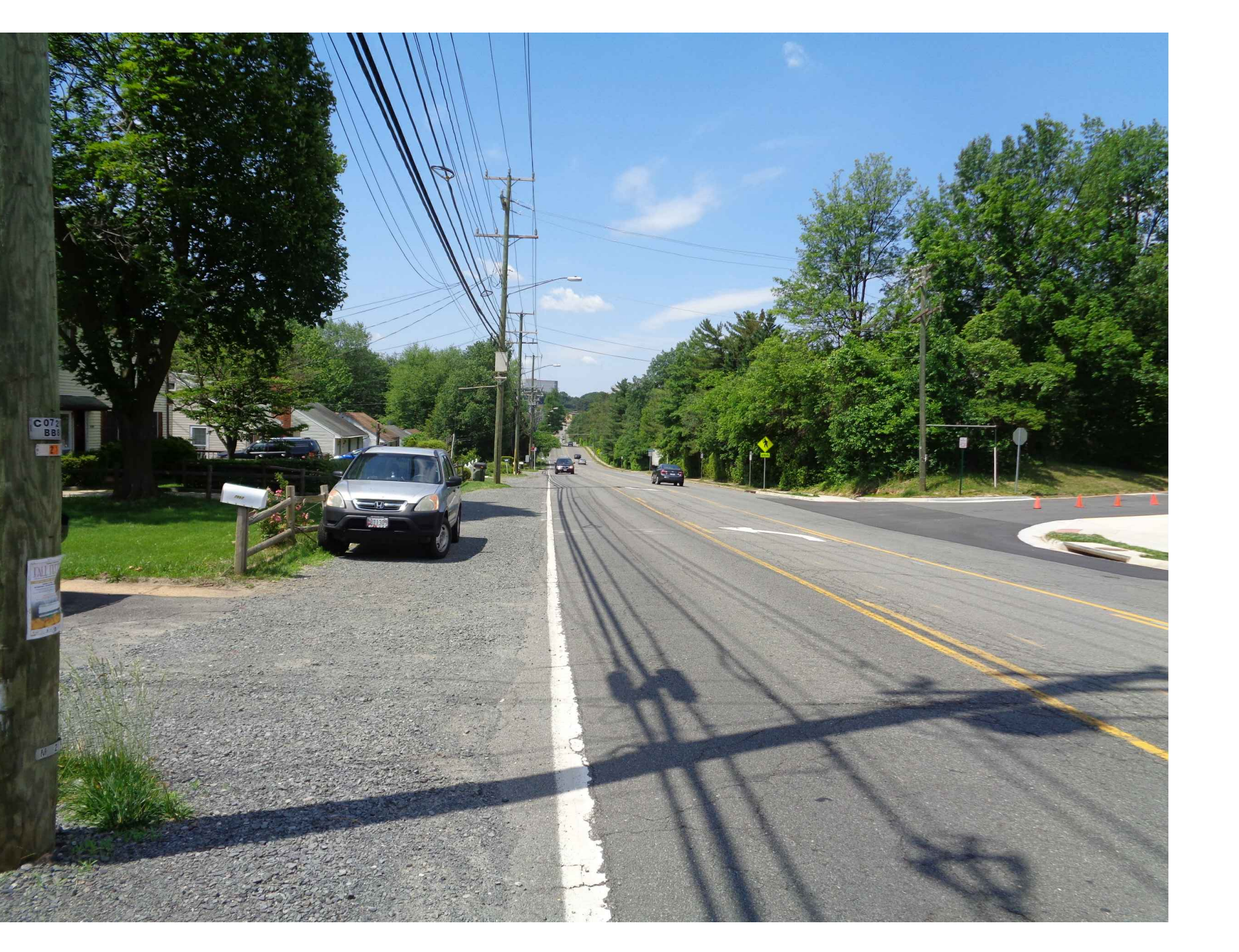
IMAGE 2: EXISTING SOUTH SIDE OF MAGARITY ROAD AT END OF SCHOOL BUS LOOP