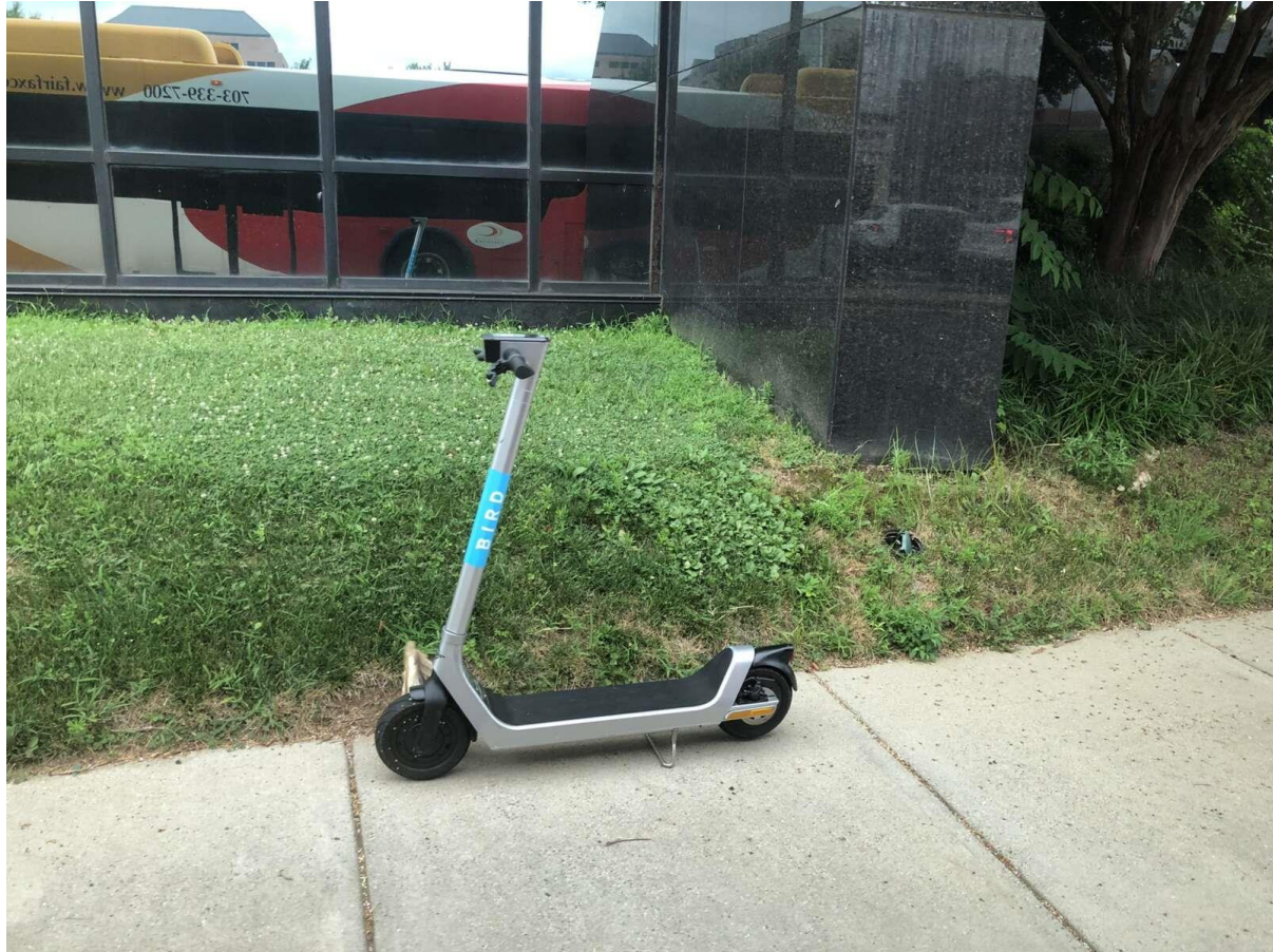
Bird e-scooter on the sidewalk in Tysons

TysonsReporter.com January 22, 2024 at 9:34am